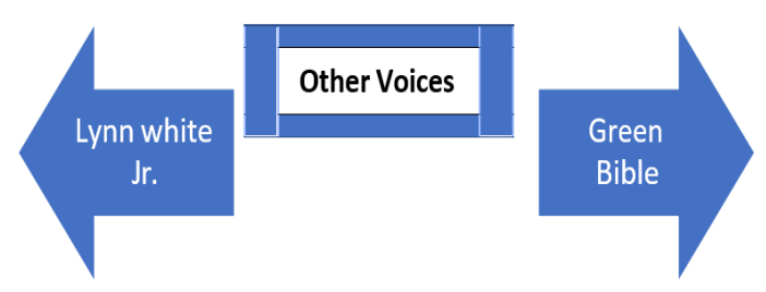
Fig 1. Eco-Biblical Spectrum

White's outright accusation and Green Bible's confident declaration are merely two representative voices in the eco-biblical arena. For our heuristic purpose, we can choose to view them as two extreme positions on the eco-biblical spectrum. There are of course several other voices that can be plotted along the said spectrum. In the interest of time, we shall briefly indicate three significant ones.