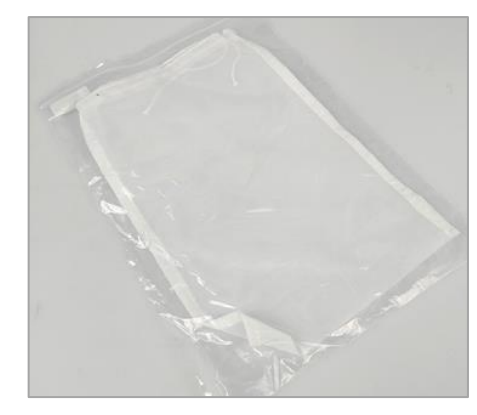
Figure 10. Clean Cloth for Squeezing Blended Ginger Juice