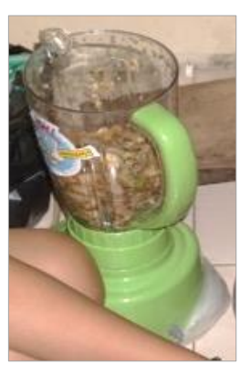
Figure 15. Ginger Cut into Small Pieces for Easy Pureeing

The ginger that has been cut into pieces is then mashed using a blender, by adding a little water to make it easier to smooth.