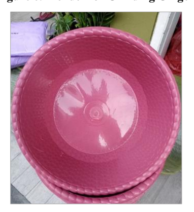
Figure 7. Basin for Collecting Ginger Juice