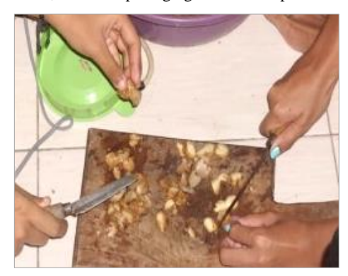
Figure 14. Ginger Cut into Small Pieces for Easy Pureeing

To make ginger juice, first, brush the ginger skin and remove the decayed or damaged parts. Based on Kustanto and Isnaini's research, it is stated that the essential oil content in ginger will be wasted more on peeled ginger than brushed ginger, because most of the essential oil components are contained under the ginger skin [9]. Then, wash the ginger rhizome thoroughly until all impurities are removed. Next, cut or chop the ginger into small pieces.