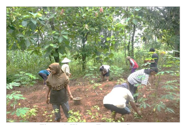
Figure 1. Women Farmers Group Planting Ginger

agricultural commodities produced in the village where KWT is located [1]. Activities often carried out by KWT associations are live pharmacy farming or planting family medicinal plants, one of which is ginger. However, it is unfortunate that these activities have not been carried out optimally, especially to improve the family economy, because they are only consumed personally.