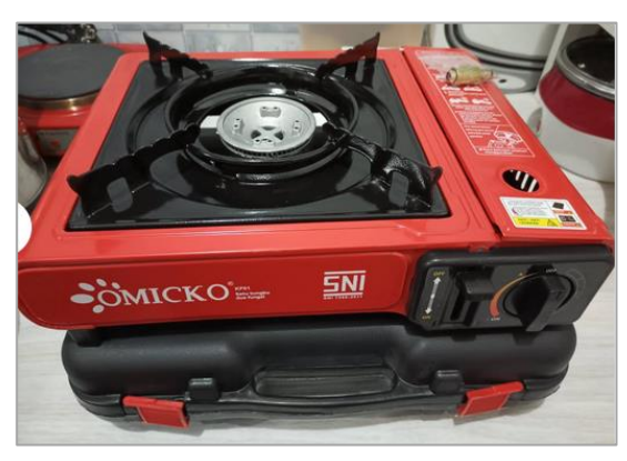
Gambar 12. Stove for Cooking Ginger