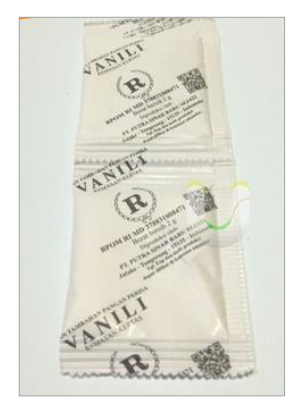
Figure 5. Vanili Sachet

In addition, the tools needed are a blender, basin, knife, cutting board, clean cloth, wok, stove, spatula, and tablespoon.