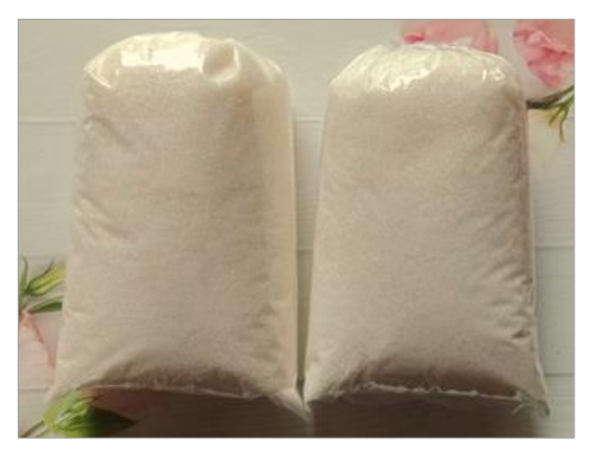
Figure 4. Sugar