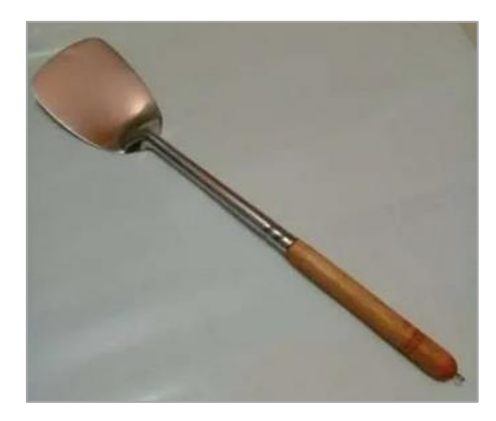
Figure 13. Spatula for Stirring Ginger Juice

To make ginger juice, first, brush the ginger skin and remove the decayed or damaged parts. Based on Kustanto and Isnaini's research, it is stated that the essential oil content in ginger will be wasted more on peeled ginger than brushed ginger, because most of the essential oil components are contained under the ginger skin [9]. Then, wash the ginger rhizome thoroughly until all impurities are removed. Next, cut or chop the ginger into small pieces.