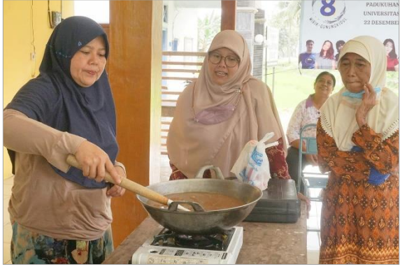
Figure 16. Some of the PKK Women Processing Ginger into Syrup

The next phase is to process the ginger juice into ginger syrup. The juice from the ginger juice is then put into a large pan to cook. Then, sugar and brown sugar are also added and stirred together with the ginger juice. The ginger juice, brown sugar and granulated sugar are cooked together until the sugar dissolves along with the ginger juice. During the cooking process, the ginger juice and sugar solution must be stirred continuously. The stirring process was carried out for up to 1 hour from the time the sugar dissolved with the ginger juice. This phase continues until the ginger juice thickens and reduces to approximately 34 of its original amount. Once thickened, the ginger syrup is finished and ready to serve, so the cooking process can be stopped. The ginger syrup in the pan should be cooled first, before being put into storage containers or packaging. Ginger syrup can last approximately 2 weeks at room temperature and 1 month in the refrigerator.