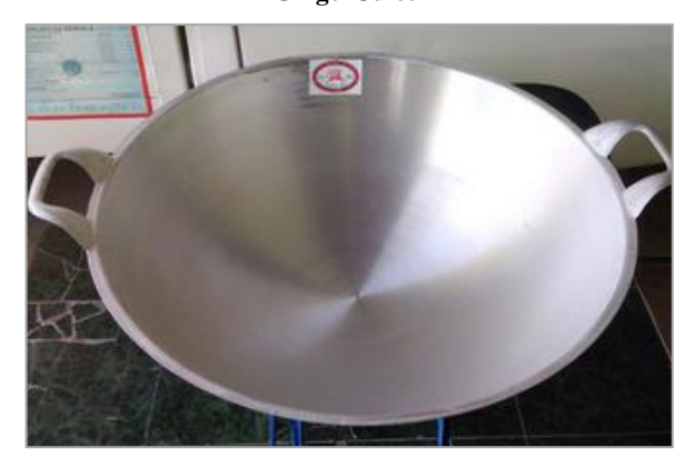
Figure 11. Wok for Cooking Ginger Juice Into Syrup