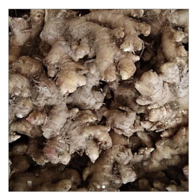
Figure 2. White Ginger

The implementation of the activity began by starting the process of making ginger syrup. At this stage, the necessary tools and materials were presented, as well as the process of processing ginger into syrup products. The main ingredient to make ginger syrup is white ginger. White ginger is larger than red ginger but smaller than elephant ginger. The shape tends to be flat with a yellowish white color, besides that the fiber is relatively soft and the smell is rather sharp. This type of ginger is often used as an ingredient to make beverages, spices, as well as food flavoring and kitchen spices [8]. The ingredients needed were 3 kilograms of small white ginger, 3 kilograms of brown sugar, 1 1/2 kilograms of granulated sugar, and 1 small package of vanilla.