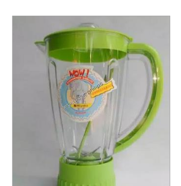
Figure 6. Blender for Grinding Ginger