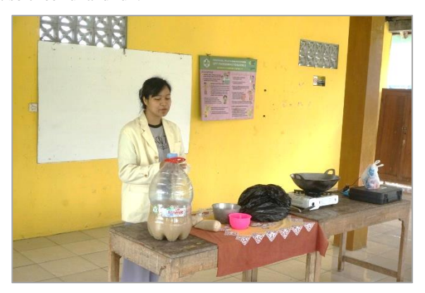
Figure 17. The Demonstration of How to Make Ginger Syrup

participated in the entire activity. In addition, the atmosphere was also cheerful and fun.