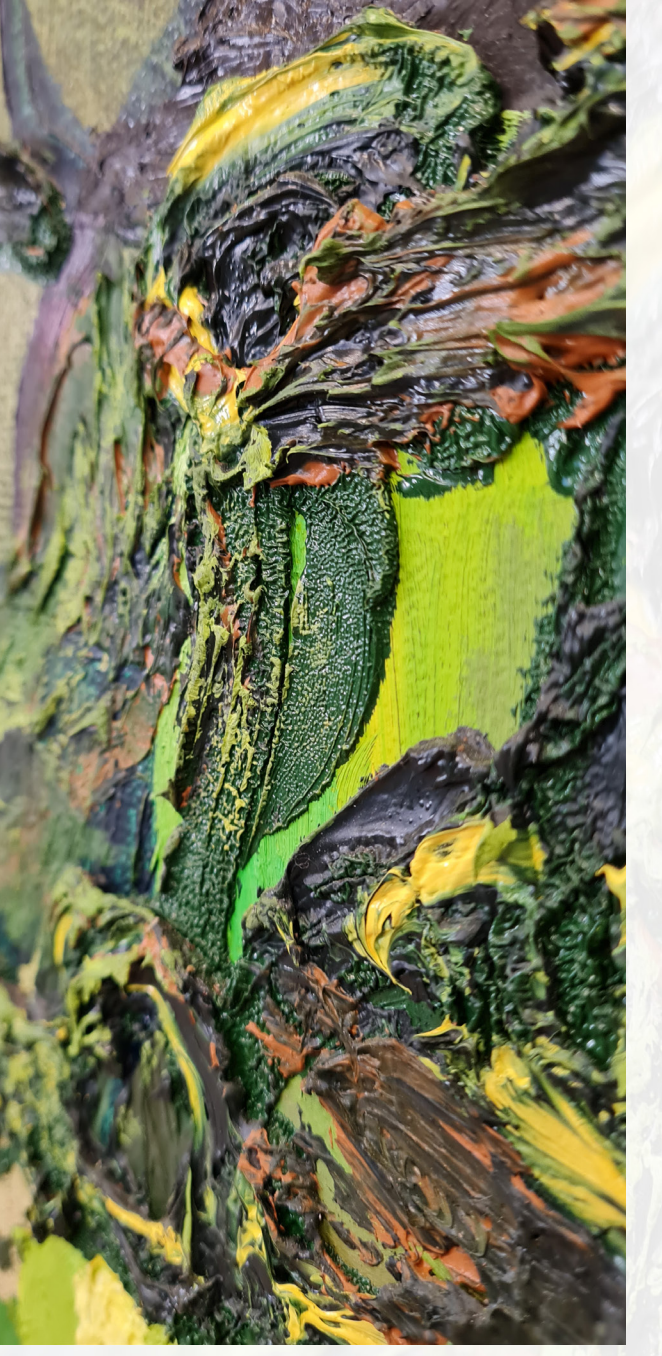
Fig. 6 Unmapped 2019, Oil on Linen, 190 x 280 cm (detail). Parts of Unmapped used thick layers of paint, impasto, to allow for a greater visceral effect upon the viewer. Artwork © Leighton Upson

Over time, the painting process has emphasised a method of working with intuition—experiencing the forest I have come to know well. Intuition allows us to "enter into" the things in themselves (Deleuze, Francis Bacon 155). As my hands touch the paint, my eyes touch the plant and its configurations. In being responsive to 'forestness' and the paint itself, the painting now carries and elicits a fleshy presence and a viewer might be motivated to not only see but also touch into the painting with their eyes.