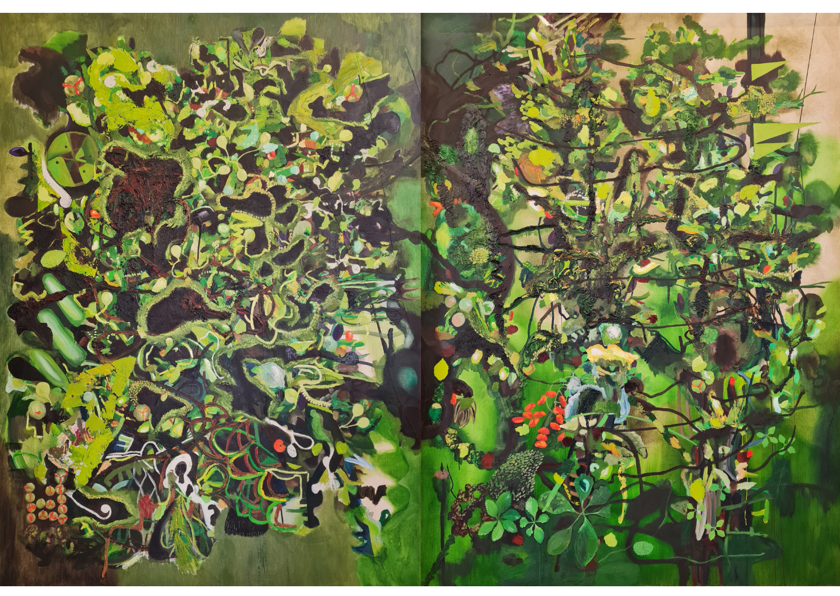
Fig. 1 Unmapped , 2019, oil on linen, two panels each 190 x 260 cm. Unmapped accumulated into an energetic writhing swarm of thick paint tissue. An upside-down, sinuous and playful kaitiaki (guardian) figure appeared in the centre at the final stages of the painting. Artwork © Leighton Upson