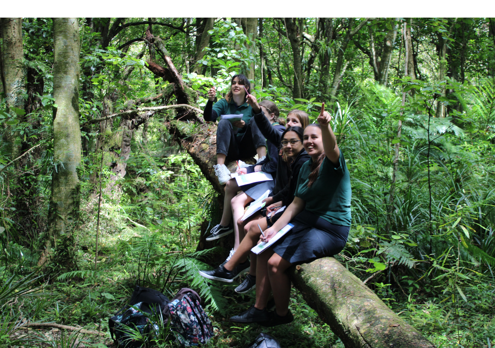
Fig. 8 Alongside my painting practice and research, I work as a secondary school teacher. The intuition of forestness is something to be shared beyond the walls of the academy.

In that month, no longer was I able to visit Rātāpihipihi, and I began visiting a forest place closer to where I live in Ngāmotu. I watched the aftermath of the ecological disaster of the Australian wildfires, and felt a growing urgency to question the very heart of my art practice. I have come to dwell on how the coronavirus pandemic has alerted us to our fragility within the checks and balances of nature. How I/we need to pay attention, take more notice, and connect to nature, especially our local ecologies. The forest is fragile, dynamic, complex and full of life and imaginative possibilities. Painting, performative of the ineffable, taps into this ecology of interactions, vitality and abundance. My immersive approach aims to persuade viewers to spend time