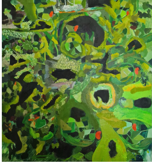
Fig. 5 Left: Unmapped 2019, Oil on Linen, 190 x 280 cm (detail). Feeling the forest urgency in loose brushwork and overlaid gestures. Right: Untitled 2019, Oil on Linen, 82 cm x 75 cm. Viewpoints from above, below and in front are combined to create an assemblage of tree holes—homes for life, such as to one of the largest insects in the world, the wētā.