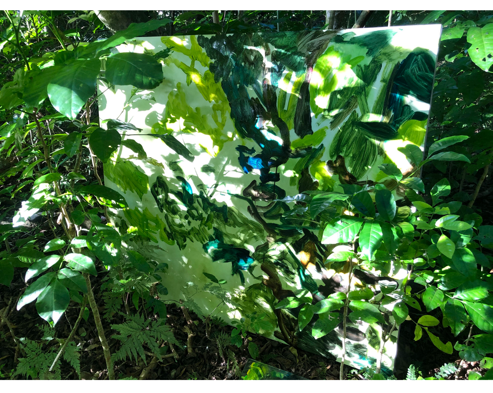
Fig. 4 Painting in the forest, immersed in its green multiplicity and light. Image © Leighton Upson

The painting calls on a people yet to come who will be more ecologically discerning in their thinking (Deleuze, Two Regimes of Madness 329).