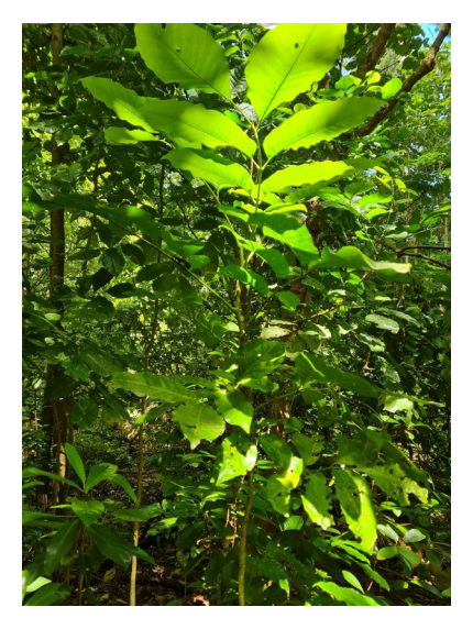
Fig. 3 Kohekohe saplings. This photograph illustrates both the thick and green nature of the forest undergrowth where I paint. The sun-highlighted leaves of the kohekohe tree draw my eyes and energise my painting hours.

territorial songs, I am with them, creating my own song of the forest; assembling my own recurring passages in paint on canvas (Figure 4). My own rhythms of presence slip into tune with those of the forest; I am there painting till late into the evening, and the ruru (the morepork or New Zealand owl) family turns their calls from soothing into piercing high-pitched hunting screeches. As the light fades, my brush in hand speeds up to render the last intuitions of that day's impressions. Ruru watch me.