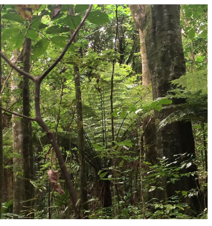
Fig. 2 Inside the old growth forest named Rātāpihipihi Scenic Reserve on the edge of Ngāmotu/New Plymouth city, Aotearoa New Zealand. This is indigenous semi-coastal forest.

Ko Taranaki te maunga whakamarumaru. Taranaki is the mountain that shelters me . Ko te mahinga toi ka hono i te hinengaro, te tinana me te waahi. The practice of art connects mind, body and place .