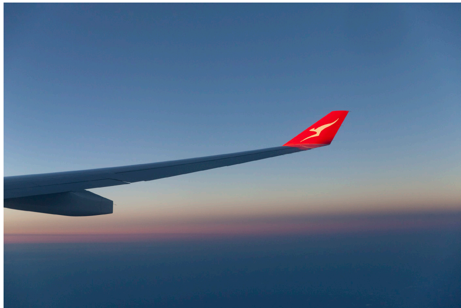
Fig. 2 High level bushfire haze observed, en route ( and blazing carbon miles ) Tāmaki Makaurau Auckland to Naarm Melbourne, 16 December 2019.

This differentiation into a ‘before’ and ‘after’ response to what seemed apocalyptic alterations of eco-social systems and lives was translated differently by all. Some researchers have detailed mainly their initial response, whereas others have deeply considered ‘before’ and ‘after’ pieces. Several concentrate on an ‘after’ or a post-conference response. Papers were expected to make a scholarly contribution that engaged, extended or questioned current thinking and literature, especially at the intersection of the contemporary environmental humanities and art. Stepping sideways from a usual academic paper structure, however, we made space in the format of the ‘after’ response, in particular: to be either critical or reflective in articulating how or what had been affected or even transformed, if at all, in practice.