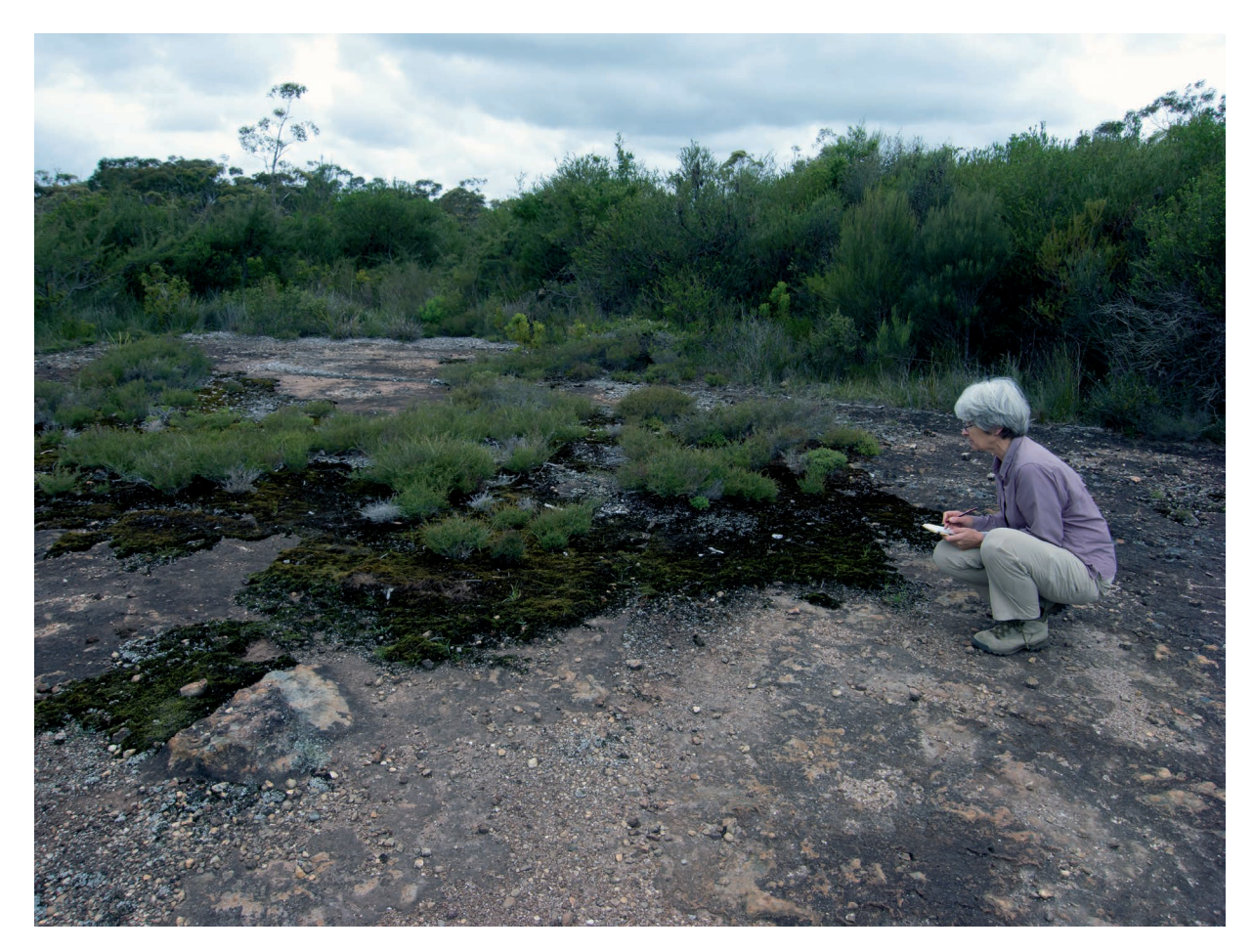
Fig. 3. Typical habitat of Calandrinia petrophila = M.Fagg (West 5554) @M. Fagg, 2011.