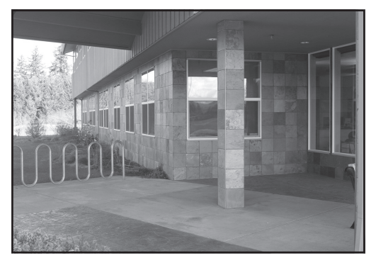
Outside of the Grand Ronde Tribal library.

The Tribal Library has one full-time staff, the Librarian, which is funded by the Tribe. We have one part-time staff, the Library Aide, which is funded by an IMLS Native American Library Services Basic Grant. We also have two volunteers, one who works at the library on Saturdays and one who helps with special events and displays. The library is open eight hours per day Monday through Friday and four hours on Saturday.