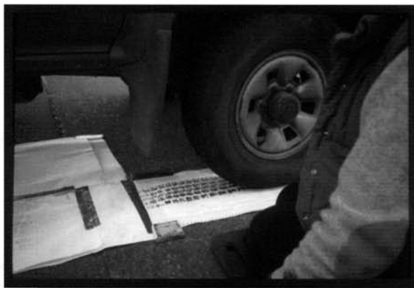
The author's Toyota in the process of making a good impression.