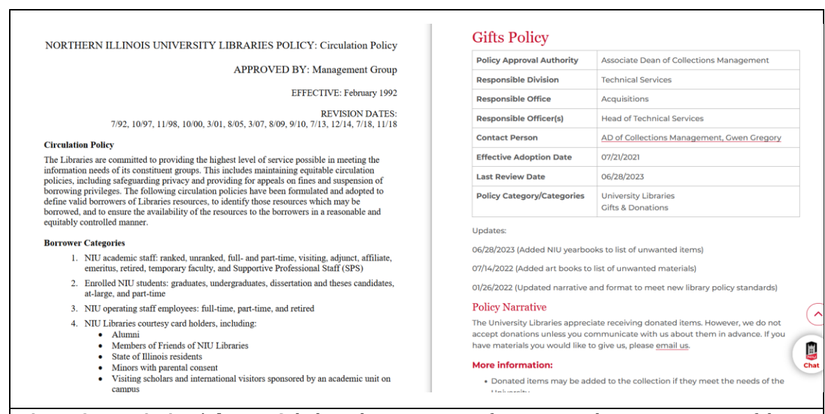
Figure 3 Description/Alt text : Side-by-side comparison of previous and present versions of the NIU Libraries Gifts Policy. On the left is the previous version: a PDF document last updated February 1992. On the right is the current version: a web page with dynamic HTML, using the university standardized format and headers and last updated in July of 2022.

At NIU, the library administration has begun assigning policies to the appropriate departments and staff for updating. Some have already been completed using the documents produced by the Policy Review Task Force. Figure 3 displays the difference in visual (and screen reader) readability already accomplished by simply changing formats.