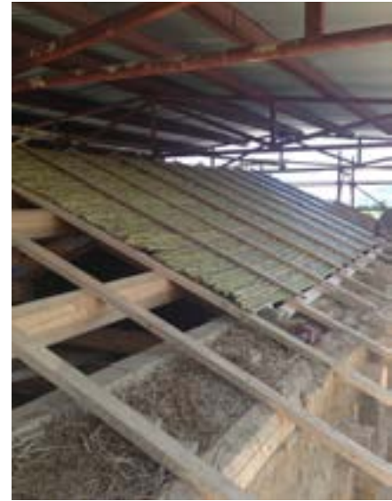
Figure 25: Laying of the laths made during the 2015 workshop (CEDTerra)

better distribute the loads (Fig. 24). Joists placed above the beams support the brick flooring.