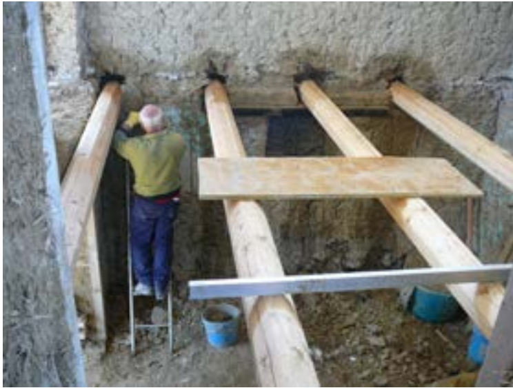
Figure 24: Laying the new beams in the west room (CEDTerra)