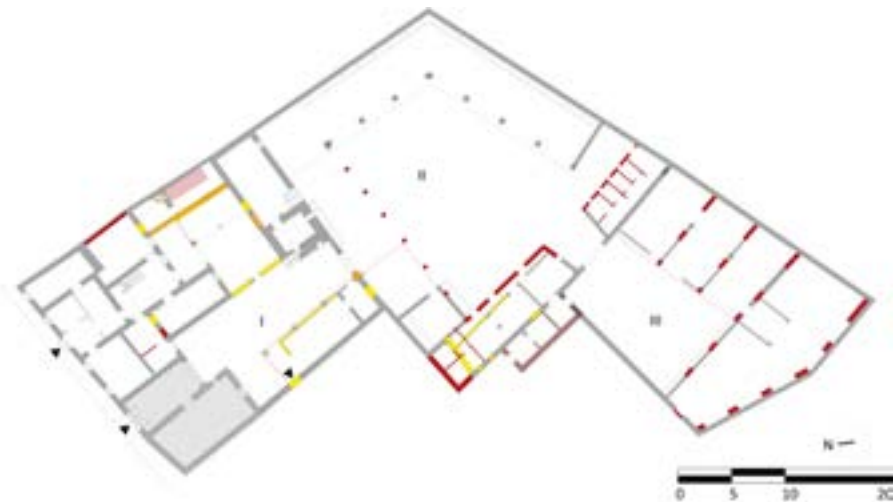
Figure 5: Demolition and reconstruction plan. The demolition is marked in yellow and the new construction in red

An integral, philological restoration of the house was made in courtyard I, based on traditional materials and construction techniques. Diagnostic investigations were carried out after removing plaster and renders. To re-establish structural integrity, steel ties were installed