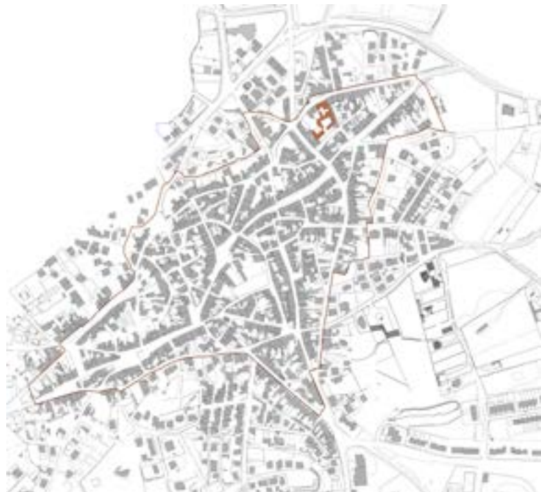
Figure 2: Earth houses tour in and around Casalincontrada. The Casa di Teresa is marked in red (CEDTerra)