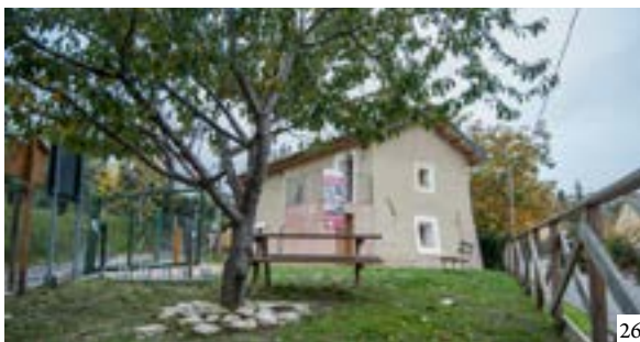
Figure 28: Massoni walls left without plaster on first floor to the west