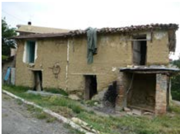
Figure 17: La Casa di Teresa before the intervention, view of the south-east elevation. (CEDTerra)

used to restore part of the walls, and weeds were growing at their base.