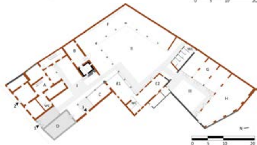
Figure 6: Project plan, ground floor. Courtyard I: A) exhibition rooms and tourist agency; B) storerooms; C) tasting rooms; D) Villa Fenu; 1) portal and entrance hall to the courtyard; 2) main entrance; 3) connection to Villa Fenu. Courtyard II: E1) cafeteria and E2) kitchens; F) exhibition area. Courtyard III: G) workshop and laboratories; H) conference room. Red: ladriri masonry; black: concrete; dark grey: stone masonry; grey: fired bricks and hollow bricks