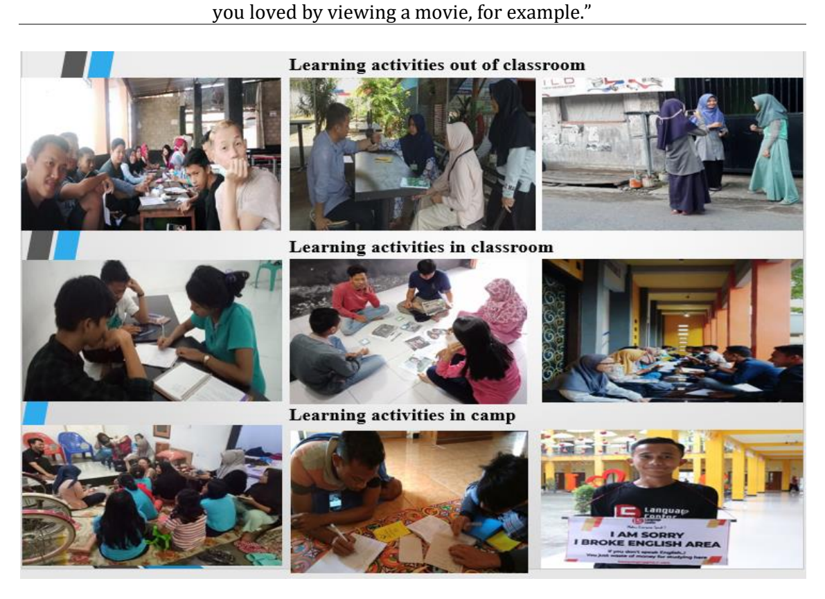
Figure 3. Learners' Learning Activities in Immersive Environment

merely from a song; you can find podcasts or other sources of what