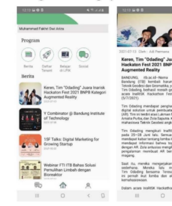
Fig 4. Application Preview

In the Android application there are several features that can be accessed according to the rights of the actor. Incubation participants can access all the features in the application, namely news features, module features, tenant features, and social features. Meanwhile, ordinary visitors only get access rights to open news features and tenant features. Figure 4 is a display of the LPIK ITB application