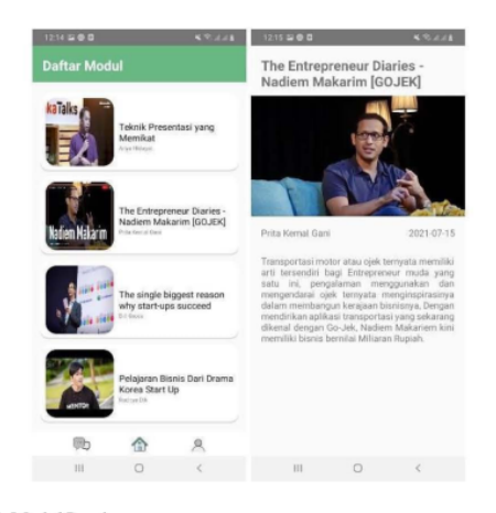
Fig 5. Modul Preview

The blended learning system used in this application uses a module feature where incubation participants can watch video modules uploaded by mentors and also a chat feature that can connect incubation participants and mentors from within the application. Figure 5 is a display of the chat feature.