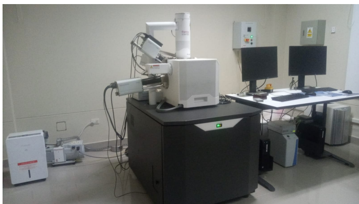
Figure 1: Thermo Fisher Scientific scanning electron microscope

The radish was harvested 30 days after planting. During harvest, leaf samples were taken from each treatment and taken for evaluation of the corresponding parameters. Soil, biol and foliar analyses were carried out at the National Institute for Agricultural Research (INIA) located in Huaral, Peru. Finally, stomatal density was determined using a Thermo Fisher Scientific scanning electron microscope at the National University José Faustino Sánchez Carrión (Figure 1).