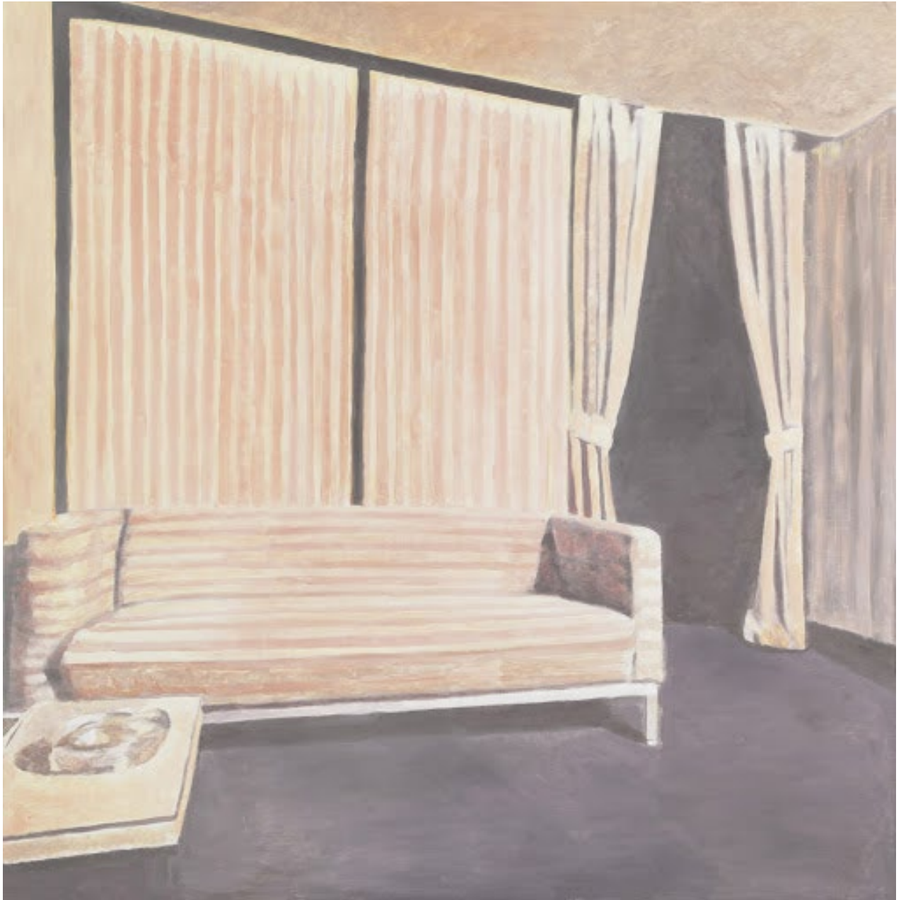
Figure 3) Interior Nr III (Tuymans, L (2010). Interior Nr III Art Observed).