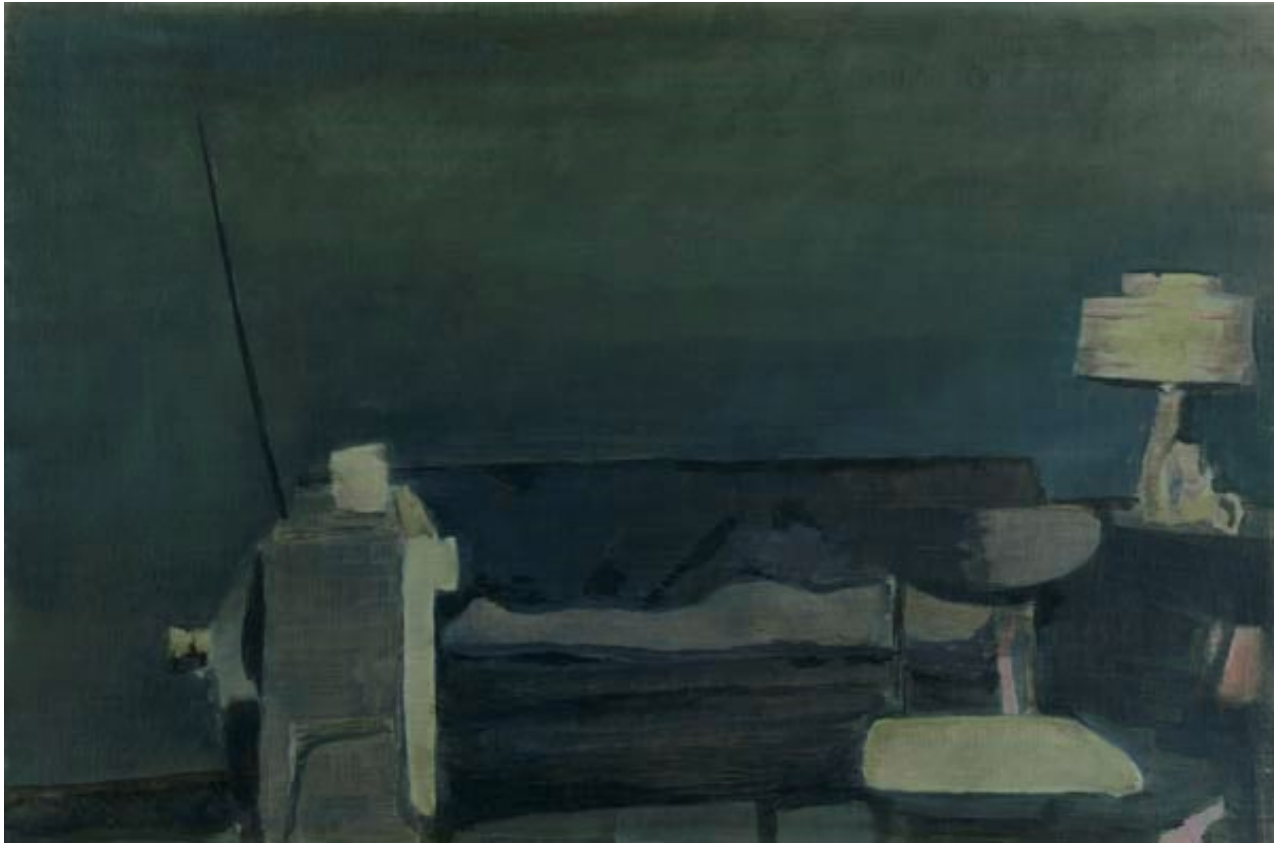
Figure 2) Blacklight (Tuymans, L. (1994). Blacklight In Loock, U., Aliaga, J . V., Spector, N., & Reust, H . R. (2003). Luc Tuymans (p.85). Phaidon Press).