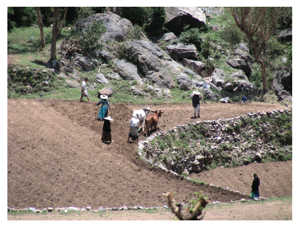
Dhamar Governorate: preparing fields for rain-fed crops, April 2007.