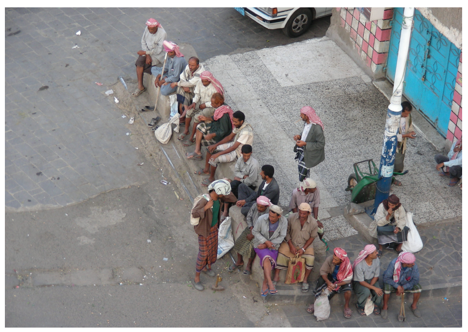
Taiz, men looking for work, May 2009.