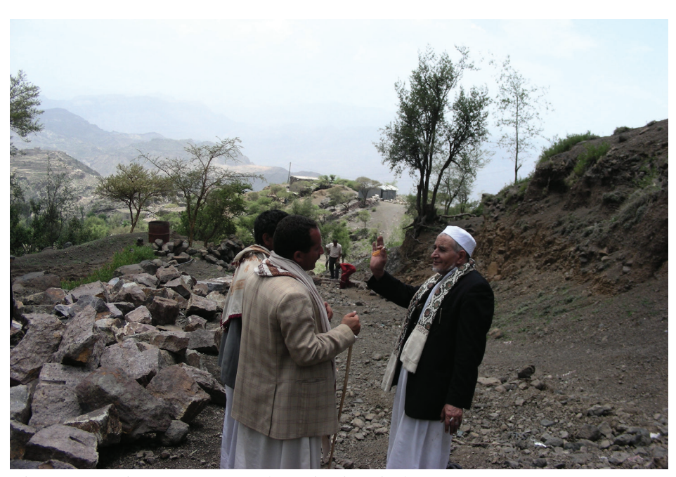
Tribesmen meeting, Dhamar Governorate, 2006.