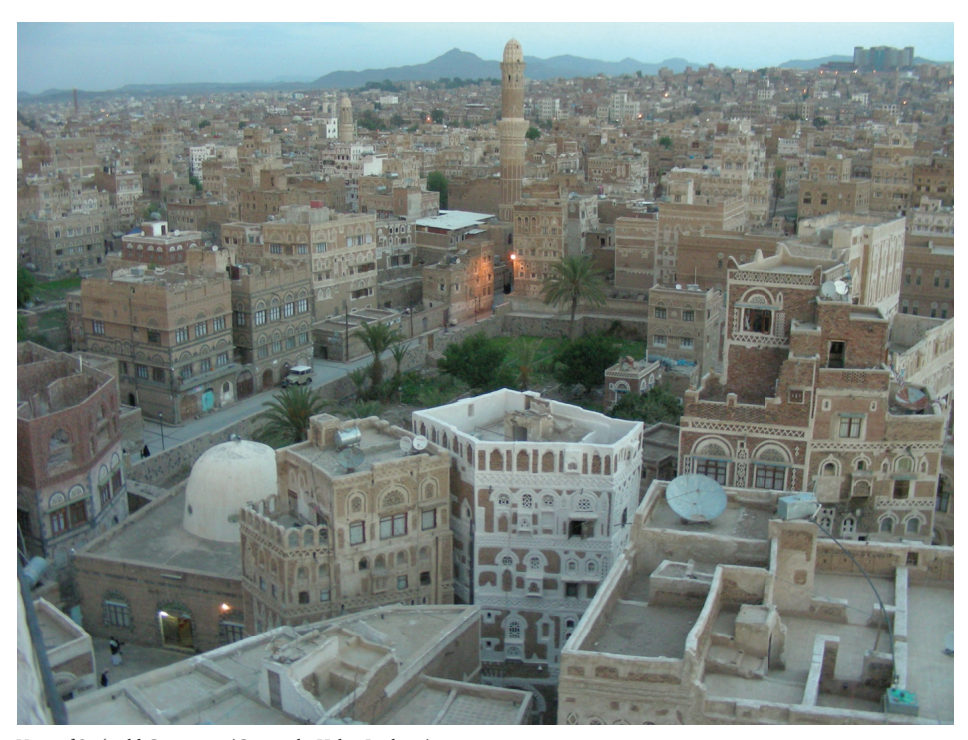
View of San'a old City, 2011.