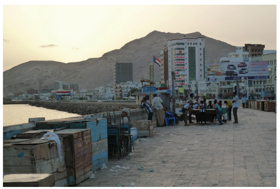
Separatist flags in Mukalla, May 2013.