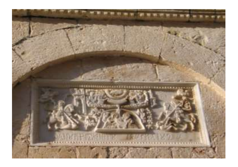
Fig. 11. Church carving: crusaders slaying 'infidels', Acca, Israel.

Pope Urban II, a committed reformer, made passionate speeches against the evils of paganism. He encouraged a series of Crusades: the 'taking of the cross' in which, incentivised by a promise of remission of sins, cohorts of militia travelled to Palestine to assert the supremacy of the Christian Church over foreign 'infidels'. Homegrown pagan groups also had to be dealt with: there was the reconquista in Spain and, in 1209, an Albigensian Crusade was sent to eliminate the 'heretic' Cathars of southern France. Numerous Papal Bulls were issued: in 1184, Lucius III condemned heresy; and in 1198 Innocent III defined it as treason. In 1252, Innocent IV issued an edict that heretics could be burned alive, and this was followed, in 12<sup>th</sup> century France, by the inquisition, guaranteed to terrify the recalcitrant.