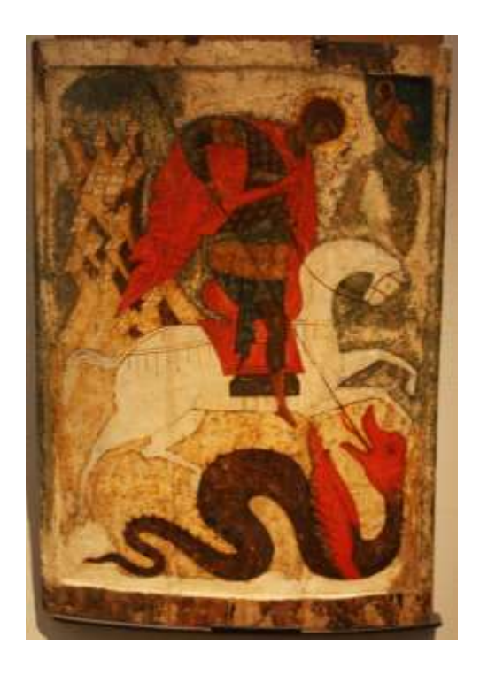
Fig. 10. Russian icon of St George and the dragon, ca.1450.

polluted by evil, including pagan 'heresy'. All of these negative potentials were represented by the water beings of earlier religions.