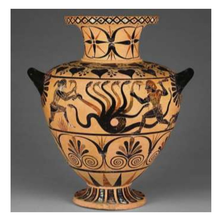
Fig.7. Hercules slaying the Lernean hydra, c. 525 B.C.E. Collection of the J. Paul Getty Museum, Malibu, California.