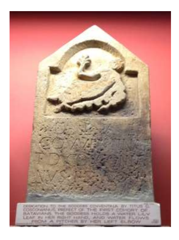
Fig. 8. Stone marker from Coventina's Well.

By the early Middle Ages a number of Christian centres had been established in Britain, one of the earliest and most important being the order of monks that came with Saint Aiden to Lindisfarne, often described as the cradle of British Christianity. Their first monastery in 635 C.E., (supported by King Oswald in nearby Bamburgh), acted as a centre for missionaries keen to convert the pagans of Northumbria to Christianity, and thus to instil its particular beliefs and values. That is not to suggest there was a sudden shift to environmental 'dominion': indeed, there is evidence that the early Christians expressed concern for the well-being of other species, but even then (as now) this was framed paternally. St Cuthbert provides a well-known example, instituting the first known bird protection laws to safeguard the friendly eider ducks and other seabirds in the Farne Islands.<sup>12</sup>