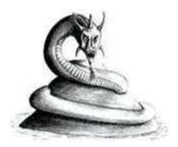
Fig. 1. The Worm around Penshaw Hill.