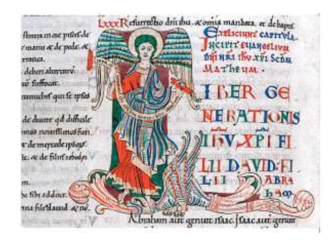
Fig.9. Illumination from the beginning of St Matthew's Gospel in a Bible bequeathed by William of St Carilef.

to complete. A Norman castle was also built on 'the Island Hill' in the 11<sup>th</sup> Century to provide an outpost of governance and a bulwark against the persistent rebellions in the north. But, far from the southern centres of royal power, in a region recognised by the Normans as a County Palatine, the Durham Bishops' authority was said to be equivalent to that of the King, with an independent right to muster armies, hold court, and to raise taxes. Crucially, these militaristic holy men were also expected to deal with the troublesome 'worms'.