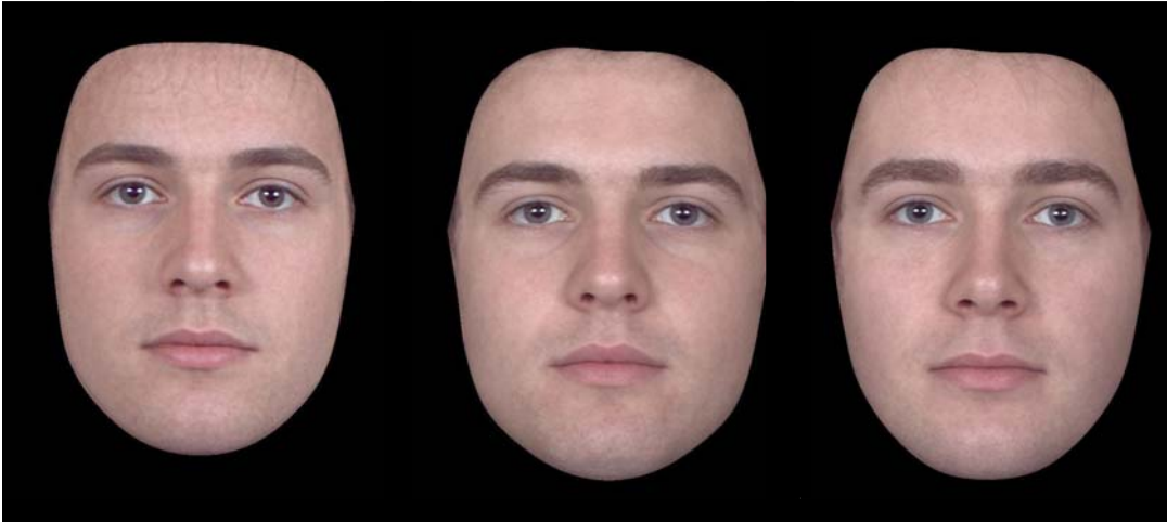
Figure 1. Base faces made by combining facial images of Caucasian adult males. Left-right: Male 1 (n=66, mean age=21.3±3.4), Male 2 (n=12, mean age=21.2±1.6), Male 3 (n=12, mean age=22.0±4.8).