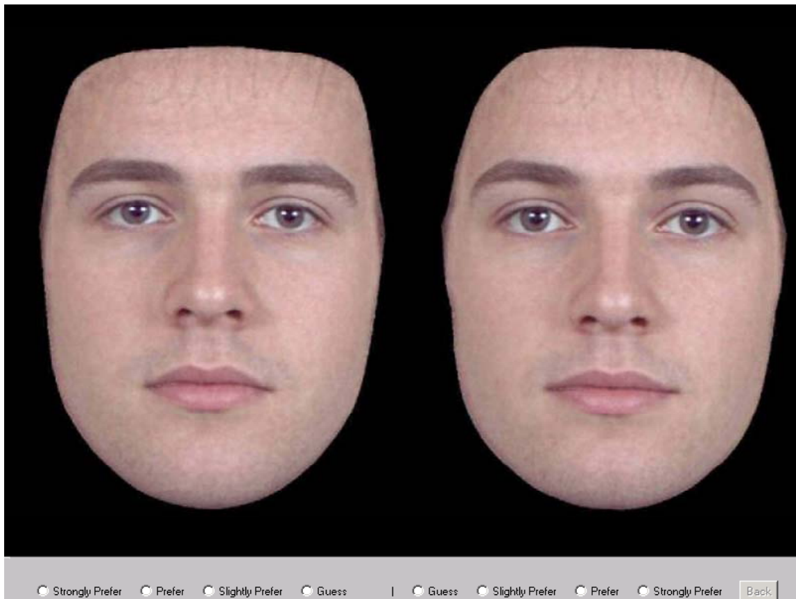
Figure 3. The Java applet used throughout the study.

Please indicate which face you prefer and how much you prefer it, by clicking on the line below.