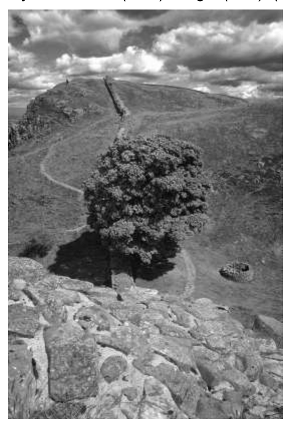
Figure 2. Sycamore Gap viewed from the National Trail along the stone curtain wall, looking east.