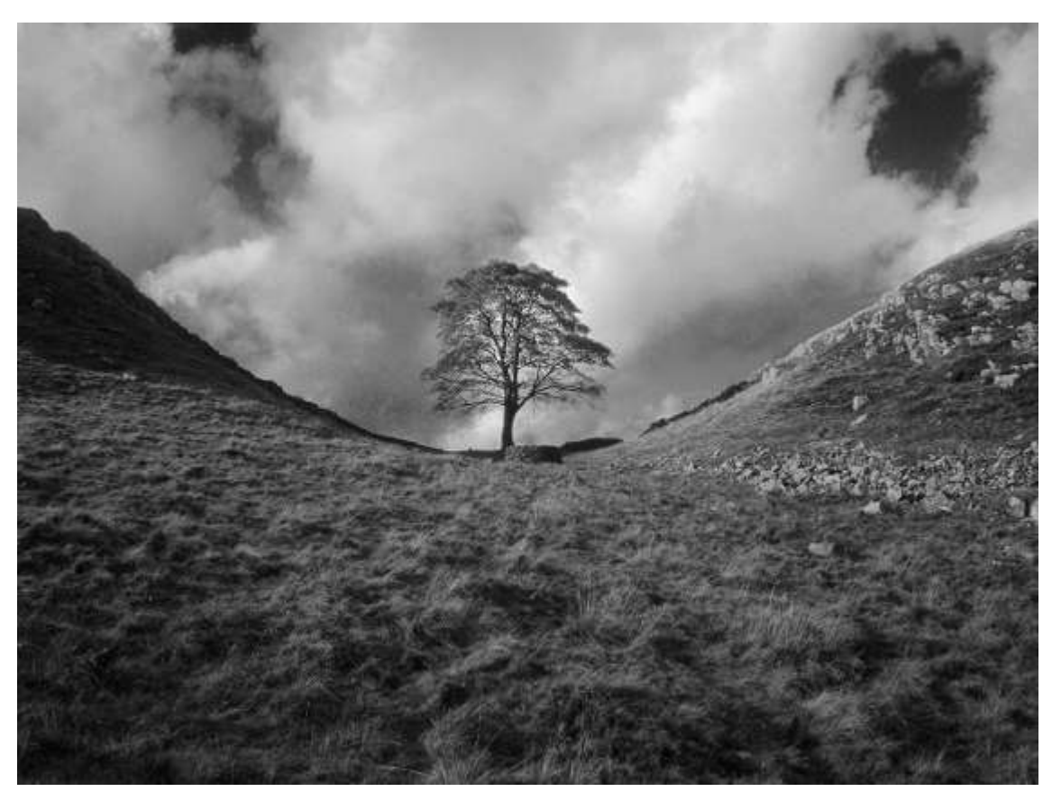
Figure 1. Sycamore Gap viewed from the south. The stone curtain wall runs along the skyline from left (west) to right (east).