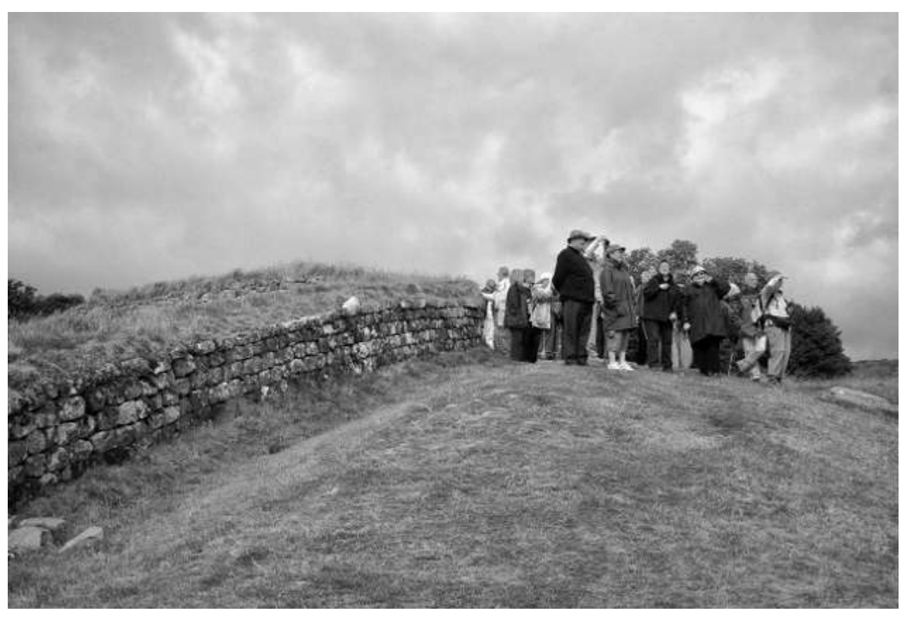
Figure 3. Pilgrims on the Thirteenth Decennial Hadrian's Wall Pilgrimage at Steel Rigg.

The transfiguration of contemporary bodies into Roman bodies dissolves any distinction between scholarly and popular encounters. Their aims and methods are the same: understanding the past through sensory experience. In using embodied encounters, archaeologists and visitors are empathizing, that is, seeking to understand others through shared experiences. For example, on Hadrian's Wall, modern visitors frequently express empathy with Roman soldiers in relation to the northern climate. As with many visitor habits on Hadrian's Wall, this practice is part of a long-established tradition: 150 years ago, Bruce (1853: 90) used empathy to suggest that the garrison of Lingones, recruited from the Burgundy region, would have found the "sunny slope" of their fort at Wallsend (Segedunum) "peculiarly acceptable".