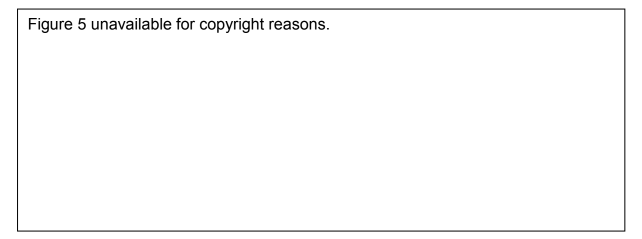
Figure 5. Reconstruction of latrine at Housesteads fort by Ronald Embleton (from Graham 1988: 18)