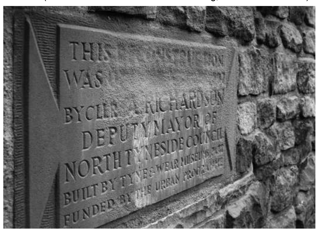
Figure 7. Modern inscription commemorating the reconstruction of a section of stone curtain wall at Wallsend.

works ( FIG 7 ). Since completion in 1997, some of the surface has been eroded away and the text left partially illegible. Powerfully but unintentionally, the inscription provides a reminder that for every well-preserved Roman inscription in a museum, many more have vanished (for consideration of what else is missing, Allason-Jones 2008).