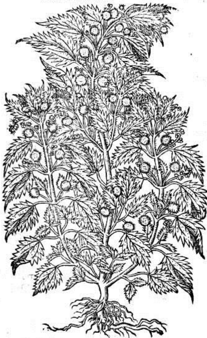
Figure 3. Roman Nettle ( Urtica romana syn. Urtica pilulifera ) (Gerard 1597: 570).

Cherry, grape vine and elephant aside, ancient texts provide limited evidence for the introduction of plants and animals to Britain. Though the writings of Pliny and Dioscorides were crucial for early herbals, these botanical inventories focused on the description and