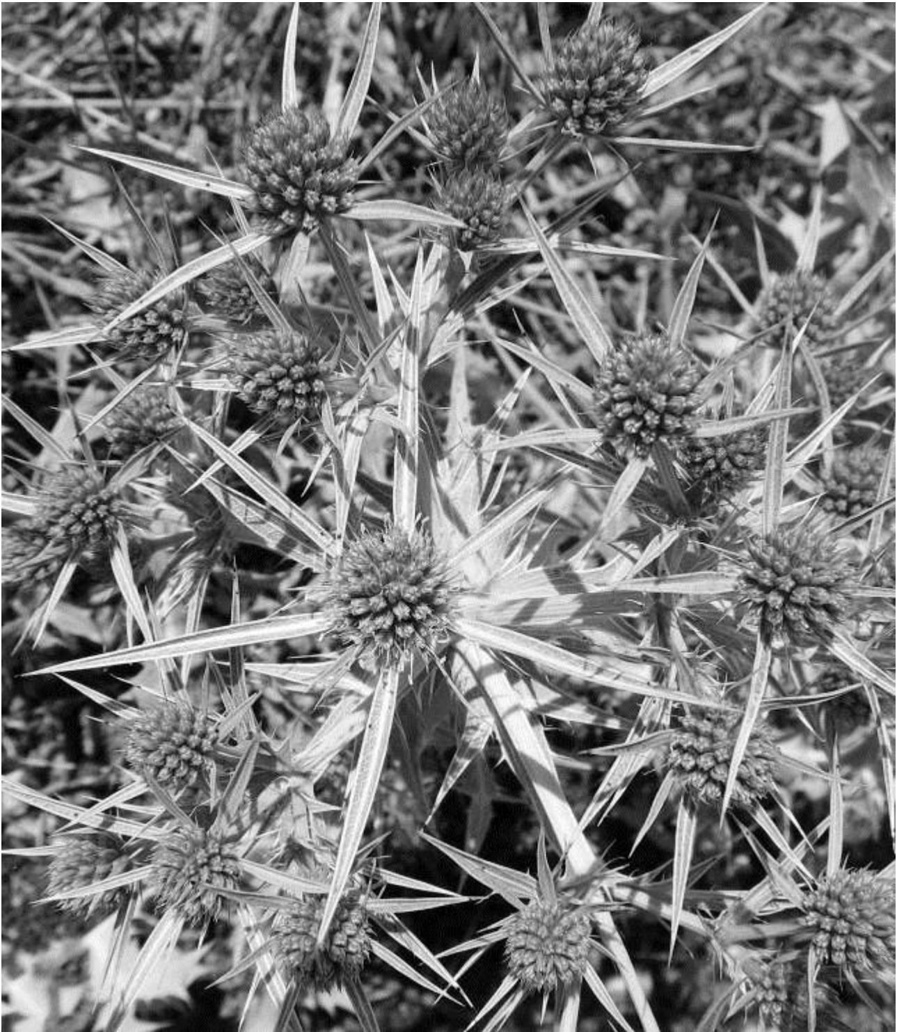
Figure 4. Field Eryngo ( Eryngium campestre ).

Proximity to Roman sites has also been used to rationalise and romanticise the presence of rare or unusual plants, including actual or suspected introductions. Anne Baker's (1854, p.386) Glossary of Northamptonshire Words and Phrases records that field eryngo ( Eryngium campestre , Figure 4) was known as Dane-weed, but that "[a]s the old Roman road is the only known habitat for this rare plant, the Watling Street Thistle is a still more common local appellation". Although association with the Roman road was important, Baker does not claim that the plant was introduced or cultivated by the Romans; in contrast, Loudon (1838, I, pp.22-3) reflects directly on the sorb tree (or true service, Sorbus domestica ) as both Roman introduction and living legacy. Referring to a famed