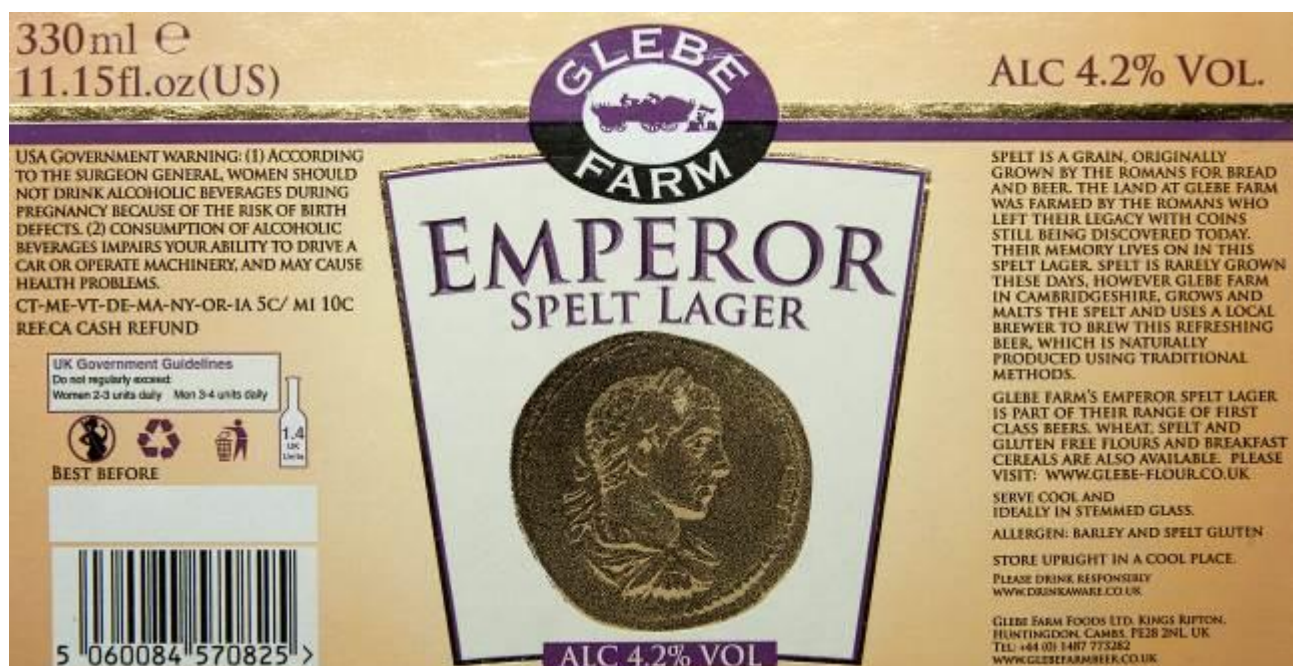
Figure 5. Emperor Lager bottle label (with kind permission of Glebe Farm, Cambridgeshire).

Here, authenticity is even further enhanced through the discovery of Roman coins, a kind of 'parallel crop'.