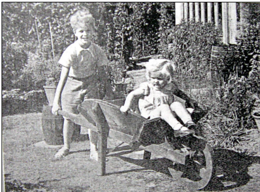
Figure 4: Photograph of children playing in the grounds of Thorpe Hall, Essex: Homes and Garden (June 1935), p. 13.

No space better epitomises the difficulties that council estate tenants faced in living up to the familial ideals of the middle classes than the back garden. Social reformers and popular writers typically presented it as a space that could (and should) be entirely given over to leisure time with the family (Bentley, 1981: 136–140). Often, it was depicted as an extension of the family living room or lounge with the gardening magazines of the time featuring full-page spreads of the latest designs in garden furniture and pictures showing how the children of the wealthy relaxed in their back gardens (see Figure 4).