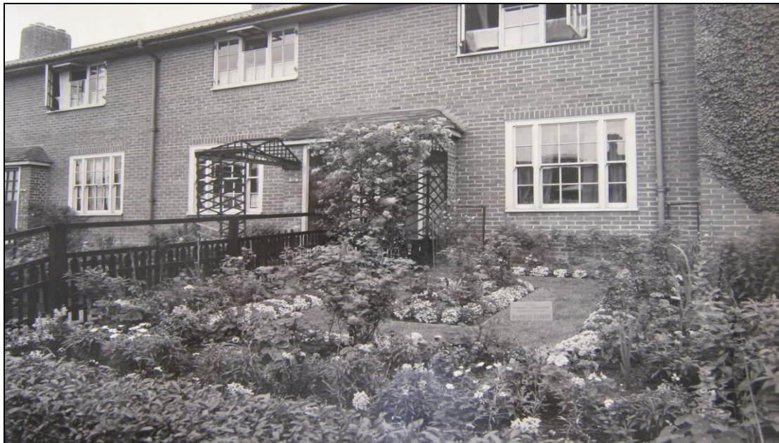
Figure 3: Pictures of two particularly elaborate front gardens on the Downham Estate taken in July 1931. SC/PHL/02 – A8111 and A8108.

As the above images highlight, elaborate use was made of trelliswork, paving and border layout in an effort to achieve something similar to the Homes and Gardens' 1927 layout. Nevertheless, the effect is clearly not the same. Whereas