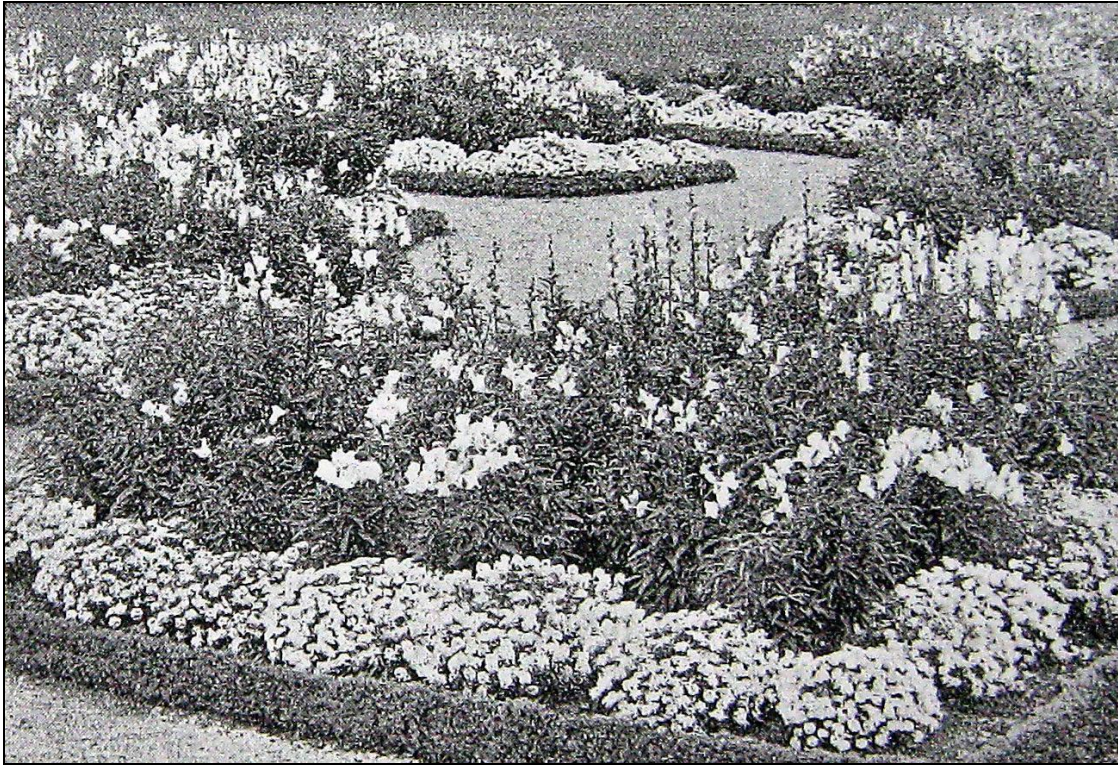
Figure 1: Herbaceous border with different types of antirrhinums; Homes and gardens (June, 1935), p. 41.

(Clayton-Payne and Elliot, 2000: 123–138). Popular gardening magazines regularly featured full-page spreads on the different types of flower one could plant, whilst the writings and sketches of garden designers such as Gertrude Jekyll, who contributed over 1000 articles to magazines such as Country Life and The Garden (Lewis, 2000), brought the beauty of the herbaceous border to an ever expanding audience (see Figure 1).