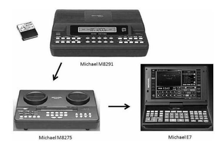
Figure 6 Three generations of hymn player produced by Michael

Nevertheless, these machines have become increasingly sophisticated over the years.<sup>26</sup> The pictures below show three successive models of 'hymn player' by the leading Korean manufacturer, Michael; the first (only about 10 years old) is chunky and offers little opportunity for manipulating playback; the second is more streamlined; and the most recent version is touch screen with many additional functions—a progression that is, of course, paralleled in other technology.