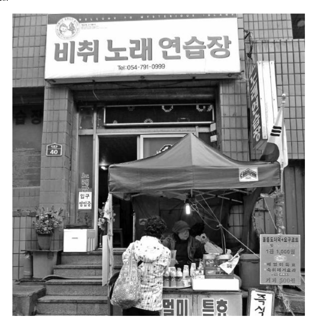
Figure 2 The entrance to Ulleungdo's first ever 'song room' venue, the Beach Song Practice Place, with the original owner at her drinks stall.

However, by 1992, the club's fortunes had dramatically changed and it was closed down and, within a few years, the other live band venues also faced a critical loss of clientele. It was the appearance of the karaoke machine to the island in 1991 that spelled the demise of live music venues.