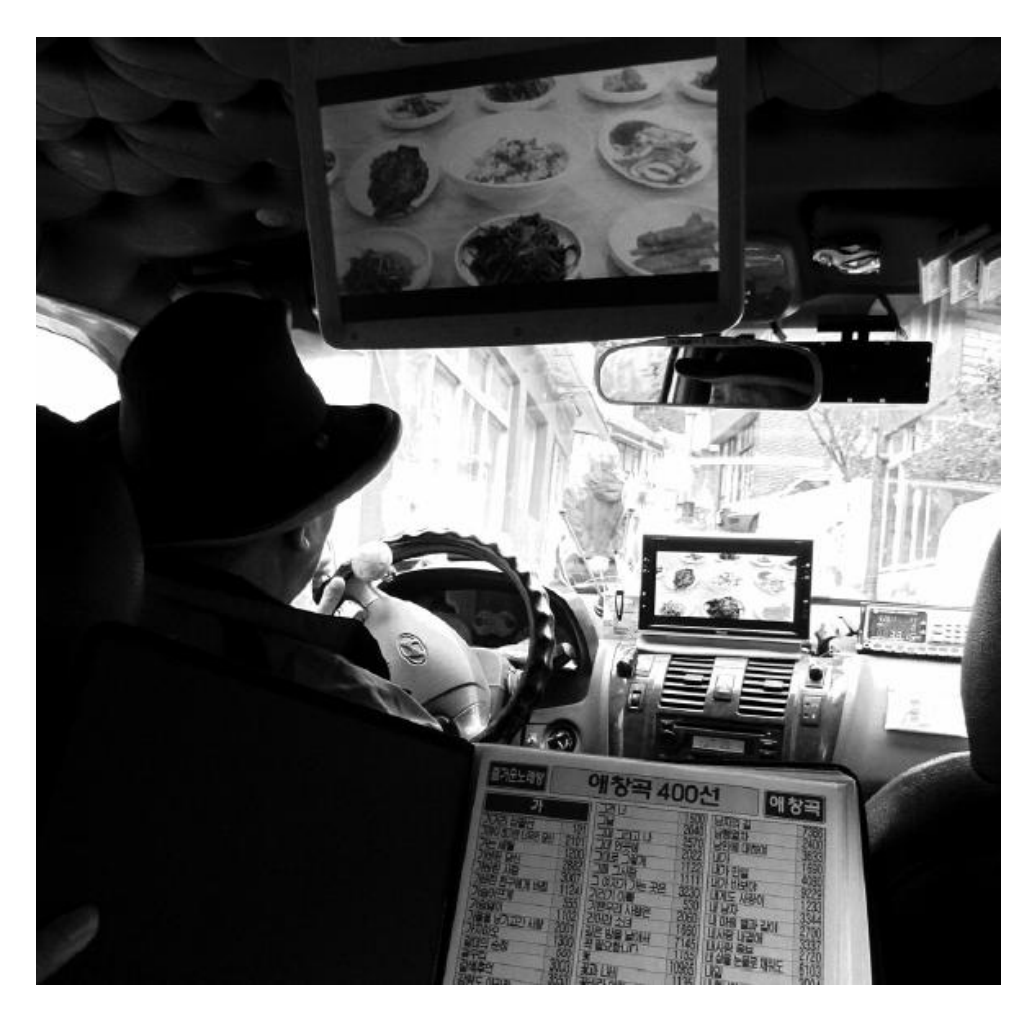
Figure 3 The interior of Kim Yŏnggon's taxi, showing his karaoke machine, with screen and song menu. Photograph by the authors, 2011

A final context in which one might encounter a karaoke machine is Kim Yŏnggon's taxi. Kim has rigged up a system comprised of the machine itself, microphone, small screen (attached to the roof), and a full menu of tunes. He told us that the machine was mainly used by tourists and seemed somewhat bemused that we considered the set-up so extraordinary—another indication of how pervasive karaoke-related technological innovation is in South Korea.