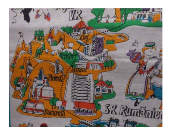
Images 1.1 (left) and 1.2 (right): a Tourex poster from 1977 with the detail of at least one fortified church on the map of Romania.

It was not just knowledge of the complexity of minorities in Romania that became ever more widespread. Romania with its southern Carpathian Arc and the Black Sea coast were also places where East Germans' longing and desire for escape could be satisfied. To be sure, some