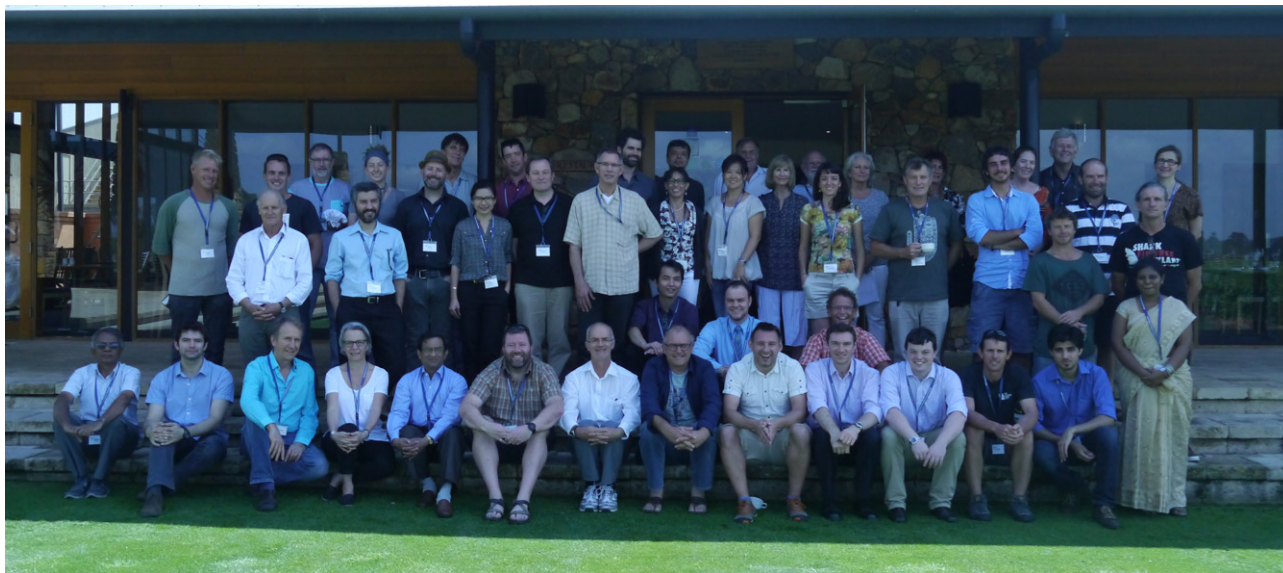
Figure 1. ICREC2015 delegates

temperatures would not allow for the use of non-insulated walls (Krayenhoff, 2015). The design of these walls often involves a highly conservative approach, that is to neglect the presence of the insulation sheet and the inner rammed earth wythe (i.e. the internal face of the insulated wall), and to rely exclusively on the structural capacity of the monolithic external wythe. Sometimes builders insert steel ties between the rammed earth wythes through the insulation layer to enforce the composite action (Krayenhoff, 2015). The structural contribution of these ties, their thermal impact and the overall strength capacity of the composite wall (rammed earth layer–insulation sheet–rammed earth layer) to resist out-of-plane loads is not well understood and needs further research.