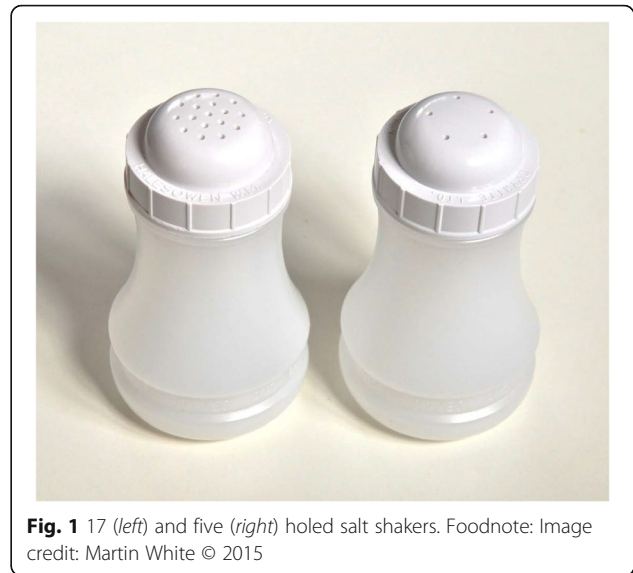
Fig. 1 17 (left) and five (right) holed salt shakers. Foodnote: Image credit: Martin White © 2015

Five-holed salt shakers (5HSS) are relatively cheap (~£2.50; $3.54; €3.14) and comparable in price, look and feel to 17-holed salt shakers (17HSS; see Fig. 1). The 'health-by-stealth' approach of 5HSS is particularly attractive and acceptable to both public health practitioners and takeaway managers and staff [3, 17]. Whilst 5HSS have been particularly associated with Fish & Chip Shops, their use has been encouraged across the takeaway sector for both servers and customers [3]. Although we are not aware of 5HSS being used outside of the UK, they may be appropriate elsewhere.