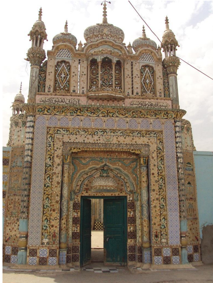
Figure 1. The gate of the Noori Mosque.

There were debates among scholars about whether or not loudspeakers should be used in the mosque when they were introduced in the early twentieth century in South Asia (Khan 2011). However, there has been no resistance to the use of loudspeakers in the mosque when it was introduced a few decades ago to these rural areas for the first time, as I was told by elderly people, because the use of loudspeakers had already been widespread in cities. The use of loudspeakers has expanded the boundaries of mosque space. I observed many instances when an announcement was made on the loudspeaker and people paid attention to it, taking a break for the moment from whatever they were doing – for instance, they stopped playing music on their mobile phones upon hearing the azaan . Since the use of loudspeakers and watches has increased over time, 5 people who regularly offer prayers in a mosque predict the time of azaan and start preparing for that prayer. The loudspeaker is not merely used for azaan but for other announcements, for example about funeral timings.