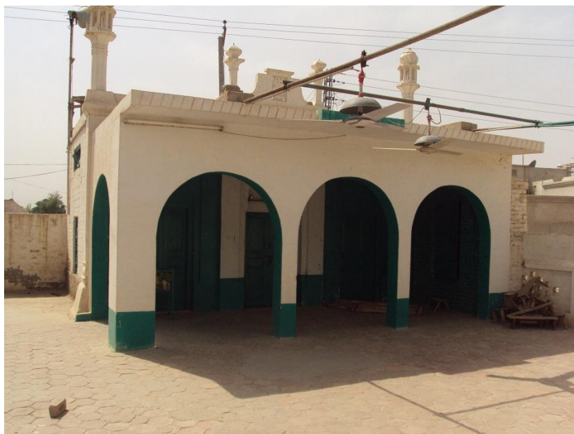
Figure 2. The courtyard of the small mosque in the village.