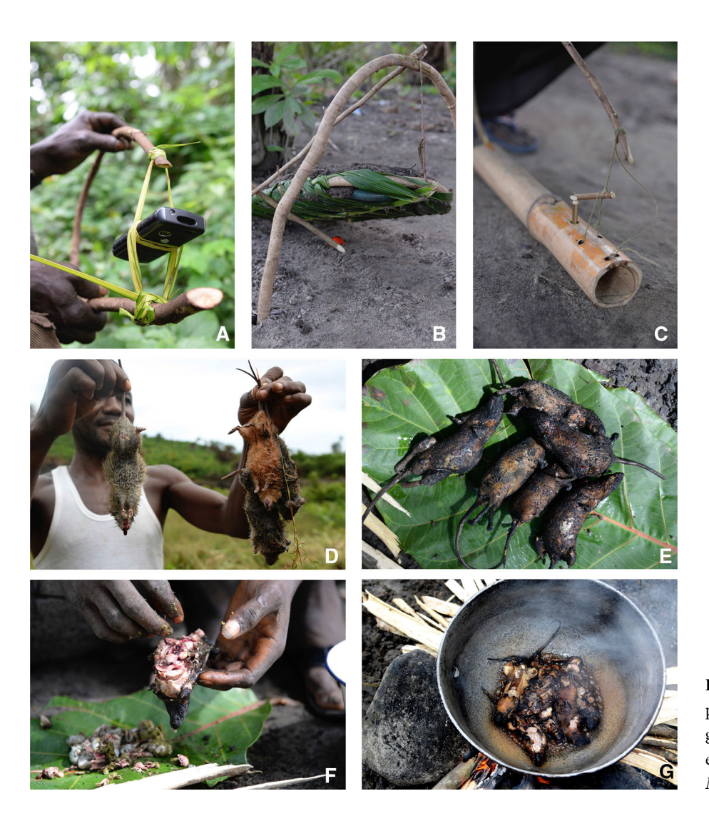
Figure 1. a Torley trap with mobile phone for scale, b kongoumie trap, c gbushie trap, d killed, e singed, f eviscerated, and g fried L . sikapusi and Mastomys spp.