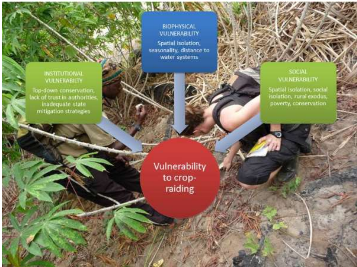
Fig 1: Vulnerability to wildlife foraging on crops: an interdisciplinary investigation in Loango National Park, Gabon (Emilie Fairet). Emilie and Kharl Remanda investigate signs of crop-foraging in a field near Loango National Park. Red indicates the overall focus of the study, green use of social science methods, blue use of natural science methods.

Emilie based herself in two remote villages in Loango National Park for over a year. She used a combination of participant observation, an ethnographic journal and semi-structured interviews to investigate the institutional and social context of crop-foraging, and quantitative survey methods to assess the biophysical aspect of crop-foraging by medium to large mammals.