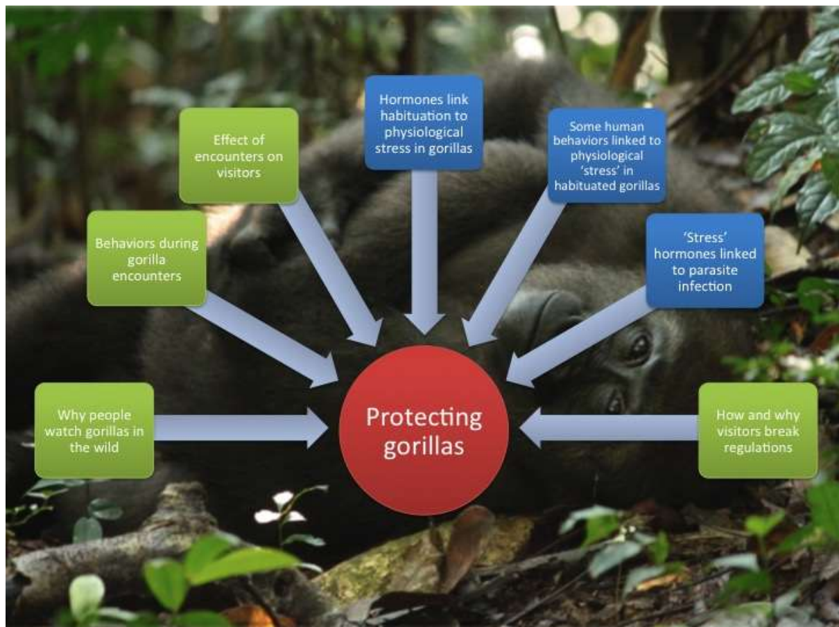
Fig 2. Wildlife tourism and conservation: an interdisciplinary evaluation of Western lowland gorilla ecotourism in Dzanga-Sangha Reserve, Central African Republic (Kathryn Shutt). A young Western lowland gorilla habituated for tourism. Red indicates the overall aim of the study, green use of social science methods, blue use of natural science methods.

The combination of biological and social methods in this study reveals far more than either approach alone (Fig 2). The outcomes of this interdisciplinary risk assessment are a set of recommendations for the specific site (Shutt 2014), many of which can be applied to other wildlife tourism settings, and will help to maximize the potential for projects to be beneficial, low-impact and sustainable conservation solutions.