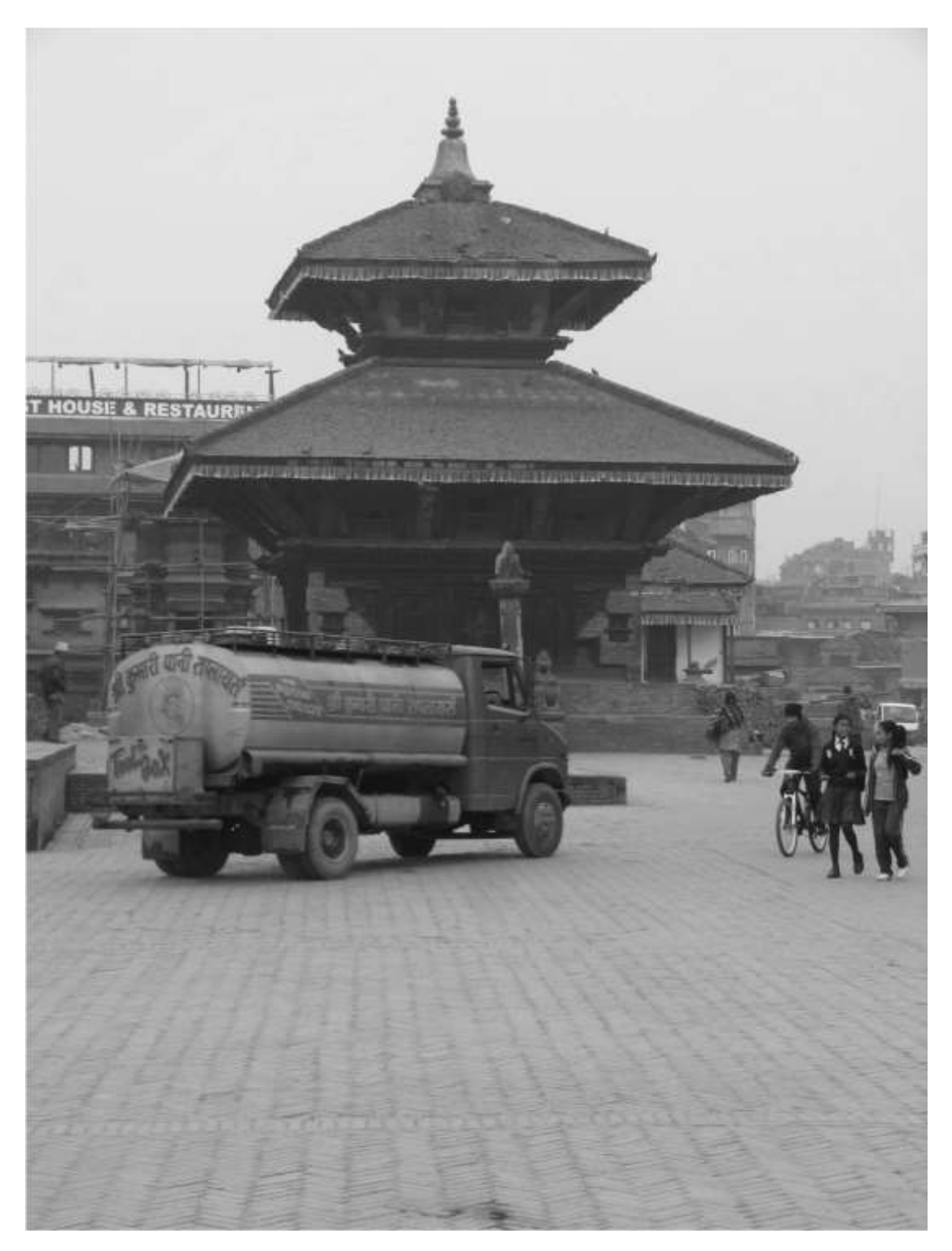
Figure 7: Heavy vehicle passing through the main Durbar Square at Bhaktapur. Photographed in October 2015.