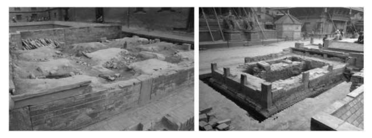
Figure 4: The collapsed Mani Mandapa in Patan, photographed in October 2015 (left) and May 2016 (right) illustrating unrecorded excavation of the foundations.

Figure 3: One of the unrecorded trenches opened on behalf of KVPT located on the lower plinth on the west of the Char Narayan Temple. Photographed in October 2015.