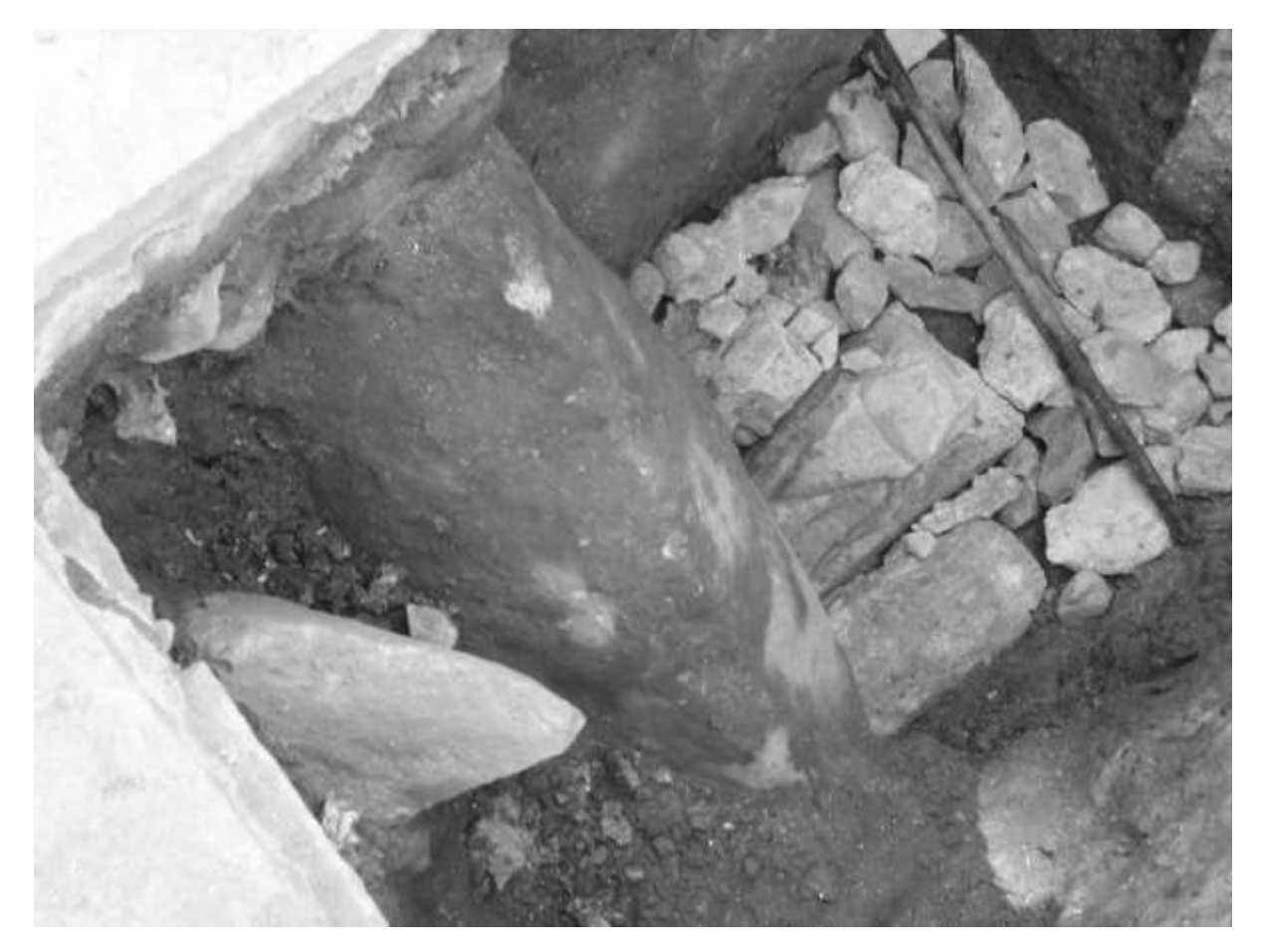
Figure 6: Unrecorded cut adjacent to a temple platform in Hanuman Dhoka Durbar Square for the installation of a lamppost.