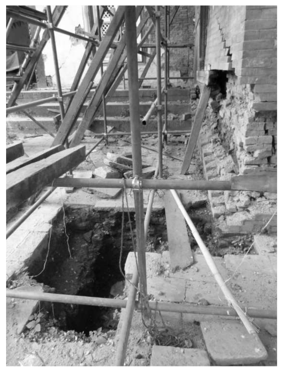
Figure 5: Unrecorded excavation trench cut alongside north facing wall of the Degutale Temple in Hanuman Dhoka Durbar Square. Photographed in October 2015.