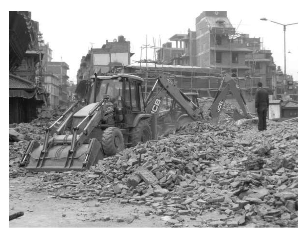
Figure 2: JCBs clearing the debris at Kasthamandap on the 26<sup>th</sup> April 2015 (Image courtesy of Kai Weise).