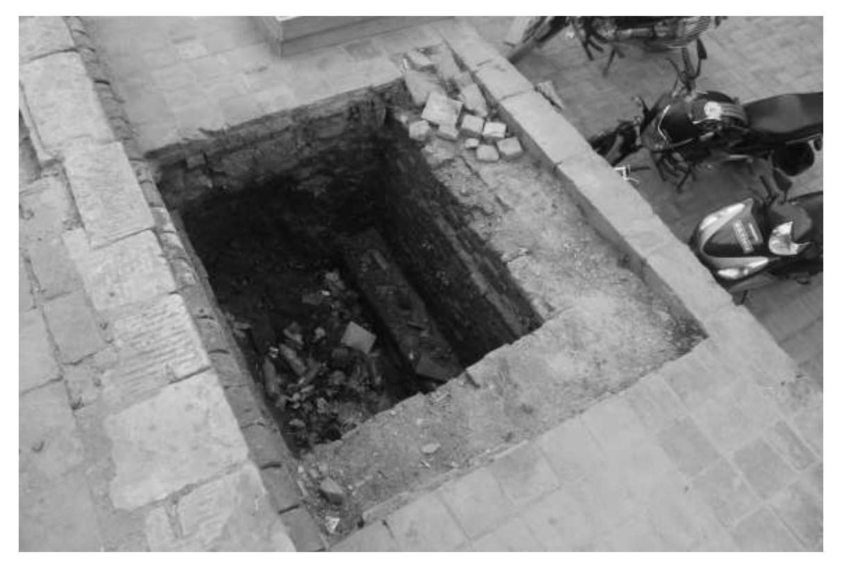
Figure 3: One of the unrecorded trenches opened on behalf of KVPT located on the lower plinth on the west of the Char Narayan Temple. Photographed in October 2015.