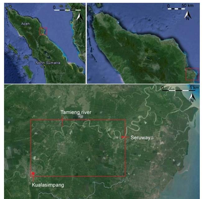
Figure 1: Approximate location of Bindjai Tamieng

the 1930's by Van Stein Callenfels (1936) on the Malayan side of the Malacca strait and was recently re-studied by a team of Singaporean archaeologists (Tieng 2013). Most of the Sumatran shell middens of the so called "Hinai midden complex" were primarily composed of shells of the brackish bivalve mollusc Meretrix meretrix and were situated between ten and twenty kilometers from the current coast line (Edwards Mackinnon 1991). According to Brandt (1976) these sites resulted from the seasonal exploitation of estuarine resources. As sea levels only reached their current level around 5000 years ago, it is likely that many of these sites were originally situated much closer to the shoreline (Miksic 1977, Edwards Mackinnon 1991).