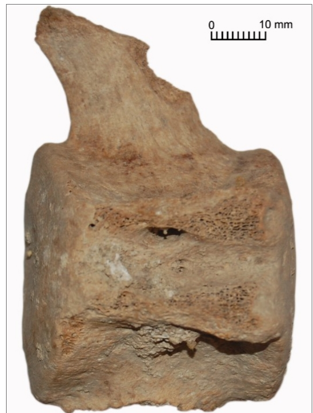
Figure 4: Caudal vertebra of a small toothed whale from Binjai Tamieng