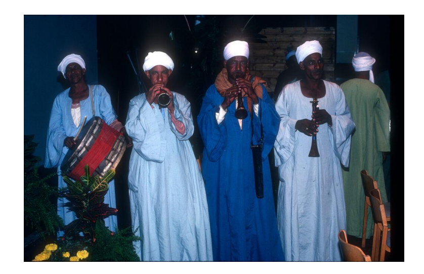
Figure 3. The Musicians of the Nile