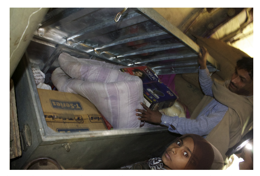
Fig. 3. A television and DVD player stored safely, waiting for the grid to arrive.

capacity. Opening up solar provision to such improvisation might be one way of ensuring their ongoing access, for "improvisation allows the work of maintenance and repair to go on", even if the technology changes from its original form ([23]: 4). Enabling users to put solar to work on their own terms appears from across our case-studies to be one critical means through which energy access endures