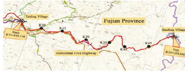
FIGURE 3: Map of Horizontal Five highway used for evaluation.