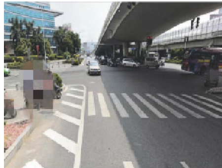
(b) G324 Line Fortress Intersection