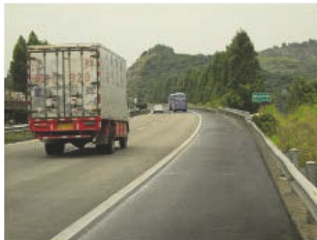
(a) Xia Rong Freeway

c This is the climatic condition at the time of the crash.