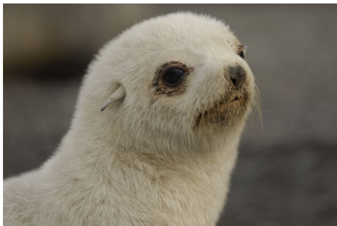
Figure 2. Phaeomelanic Antarctic fur seal pup.

phenotype, which is the result of reduced melanin production [27]. Until recently, hypo-pigmented fur seals had only been observed at South Georgia, where their relatively high frequency (one in 600–1400 individuals) is thought to have resulted from a strong historical bottleneck [15,28]. However, phaeomelanic adults have now been sighted at the nearby South Shetland Islands [29–31] as well as at Bouvetøya [32] and Marion Island [25,26], where the first confirmed birth of a hypo-pigmented pup outside of the Scotia Arc was also recently reported [25]. These observations have been interpreted as providing evidence that individuals from South Georgia (or other populations in the Scotia Arc) emigrated to Marion Island carrying with them the allele responsible for hypo-pigmentation [25,26].