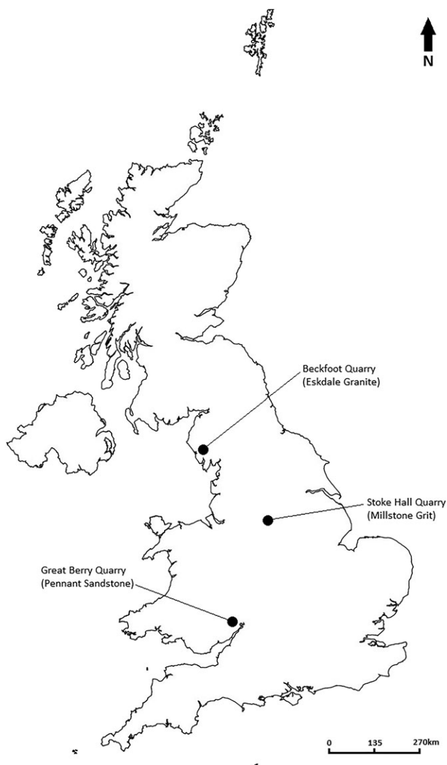
Figure 1 Locations of the rock samples: Millstone Grit, Stoke Hall Quarry, Peak District (Derbyshire); Pennant Sandstone, Great Berry Quarry, Forest of Dean (Gloucestershire); and Eskdale granite, Beckfoot Quarry, Lake District (Cumbria).

62–65; Watts 2014, 29–30). Some of these rocks, such as gabbro and basalt, will give low whole-rock ^{87}\text{Sr}/^{86}\text{Sr} typically between 0.704 and 0.708, whereas granites and schists can give very high whole-rock ^{87}\text{Sr}/^{86}\text{Sr} values, sometimes > 1.0 (Faure and Powell 1972; Peterman and Hildreth 1978; Rundle 1979; Faure 1986). Granites and gabbros (including their finer crystal grained equivalents such as rhyolites and basalts) represent the extremes of isotope composition, but they were not commonly used in Britain, with the possible exception of the imported Mayen Lava from Germany. Instead, the native abrasive sandstones and gritstones were particularly prized and, hence, more commonly used across all periods in Britain (Peacock 2013, 2–3, 62–65,