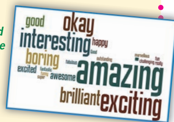
Figure 6 'How would you describe science?' Pupils' responses in Summer 2018

the responses could not have been more different (Figure 6)! The teachers thought that the early years and key stage 1 children had become more confident about what science is and the role of a scientist. Early-years children were especially engaged with this year, using investigations to develop the 'communication' strand of the foundation stage assessment. In key stage 1, children gained confidence and skills to ask questions, leading to the creation of our 'Wonder Wall', a space where children's questions were displayed with pride, and used to fuel classroom activities and investigations.