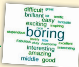
Figure 5 'How would you describe science?' Pupils' responses in Autumn 2017

linked to particular science topics (e.g. rocks and soils). Teachers became enthused about the prospect of easily organised science investigations stemming from children's 'wonder' questions in science, rather than specifically linked to a topic. Therefore, we began science topics with a 'wonder session', which allowed the children to voice their scientific wonders. My favourite was a key stage 1 pupil's wonder: 'If aeroplanes are so heavy, why do aeroplanes not fall out of the sky?' Upper key stage 2 (ages 9–11) focused on their debating skills, which were recorded at the start of the year and again at the end, to analyse the impact. Ultimately, we had some great debaters by the end of the summer term!