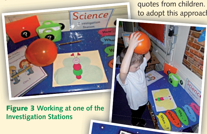
Figure 3 Working at one of the Investigation Stations

Alongside the overarching aim of the Year of Science, to use literacy skills to develop deep thinking in science, these challenges identified were used to develop three aims for our action research project: