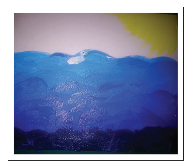
Figure 3. Participant 2.