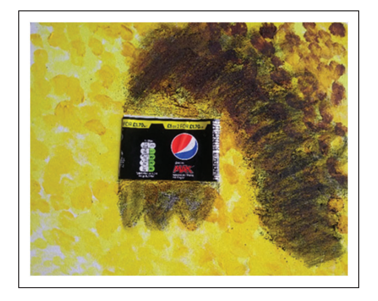
Figure 4. Participant 1.

When there is inconsistency in the behavioural profile of a child, it can result in conflict between parents and services. Participant 5 shared frustration at the lack of