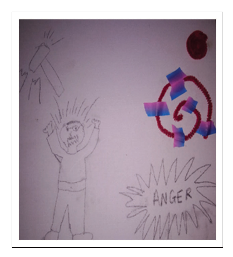
Figure 5. Participant 5.

This was an exploratory study and the first study to focus upon the experiences of mothers living with CPV initiated by pre-adolescent children. Using an ethnomimetic approach to elicit in-depth phenomenological narratives, the findings show that there are parallels between experiencing pre-adolescent CPV, adolescent CPV, and intimate partner violence. Mothers highlight that organisational responses, particularly their relationship with school, can have a significant impact on their own wellbeing and ability to support their child. Furthermore, as mothers struggle to manage the behaviours and identify the triggers for CPV, they currently recognise the behaviours as representative of mental health needs.