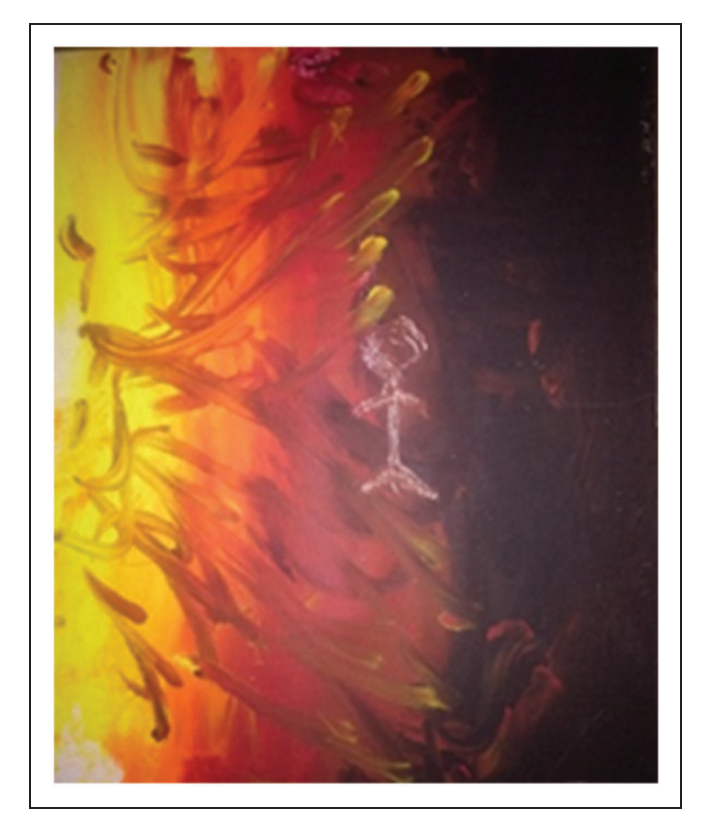
Figure 1. Participant 3.

"It touches everything, that dark shadow. I find it really hard to enjoy anything fully because the worry that he'll just flip just taints everything." (P3)