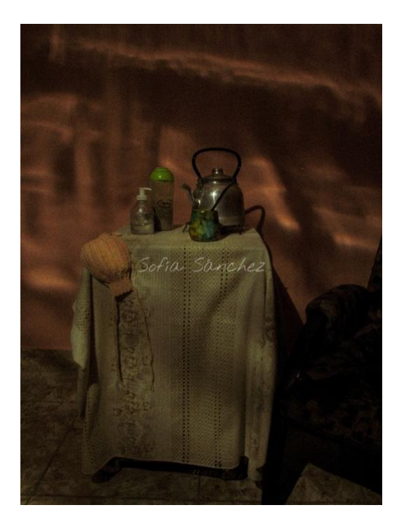
Figure 3. Coping with discomforting emotions using photography.

Source. The student is an amateur photographer and added her name to the photo as a watermark, askingthat her real name be included in any publication.