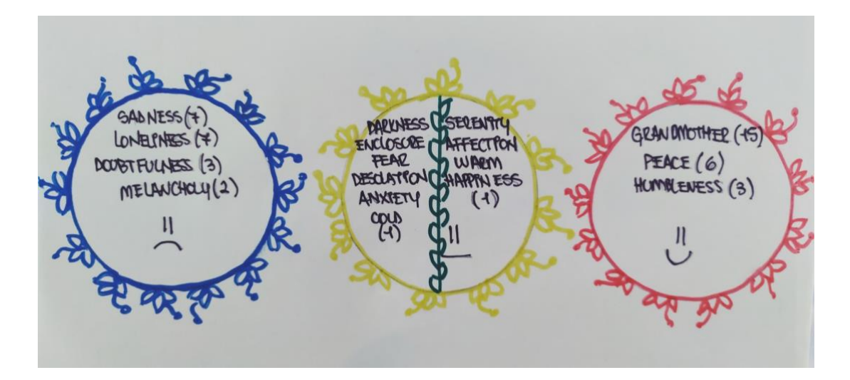
Figure 5. Graphic representation of impact of social action

In the group report of their action stage, they explained the artistic decisions around the use of colours: