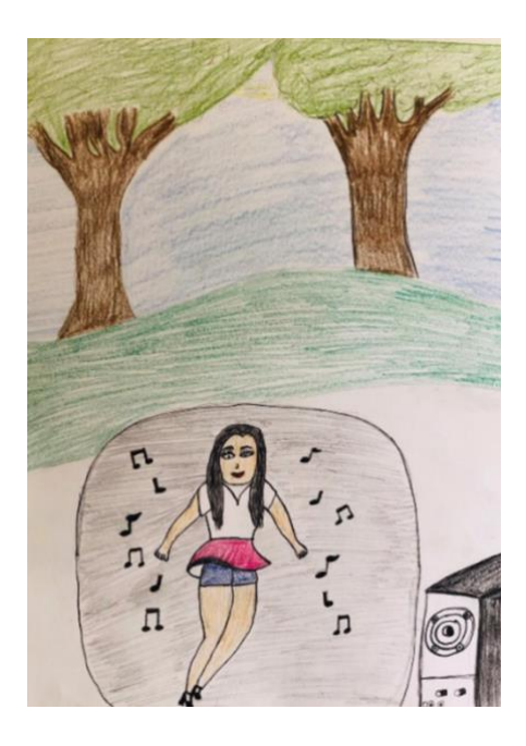
Figure 2. Channelling discomforting emotions artistically to foster hope.

those emotions, fostered hope and allowed the personal transformation ('comfort and peace') using drawing, dancing and music. [page 11 ends here]