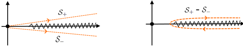
Figure 2. On the left diagram we show the two different lateral Borel resummations. On the right diagram, the difference between the two lateral Borel resummations is represented as an Hankel integral contour, used to evaluate the Stokes automorphism.

terms. Following [20, 53], we will make the assumption that the complete transseries parameter does in fact depend analytically on (a+2b) , and the “minimal analytic completion” with non-trivial real part is simply