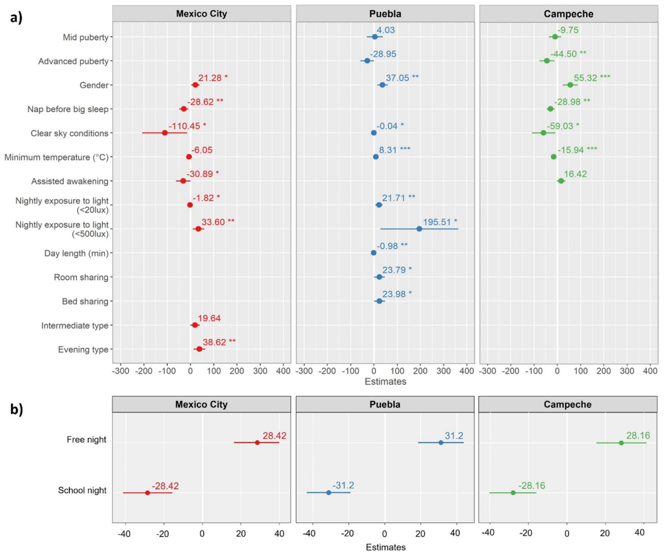
Figure 2. Effect sizes for site-specific multilevel models. (a) Estimates for fixed effects (i.e., predictor variables with a constant effect on the individuals' sleep duration). (b) Estimates for random effects (i.e., weeknight-level variation on sleep duration).

in urban adolescents who perceive academic activities as dull or repetitive 15 . Still, these hypotheses remain speculative and further studies are required to test them. Additionally, in agreement with the Sleep Continuity Theory 39 (which states that a minimum of 10 min of interrupted sleep is needed to serve a restorative function), variation in self-rated drowsiness could reflect differences in participants' sleep efficiency (i.e., the ratio between the total time spent asleep and the total time in bed). While this matter is beyond the scope of this paper, future research will examine whether sleep efficiency is higher in both indigenous rural settings than in Mexico City.