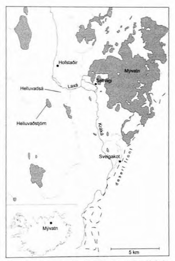
Fig. 1. Location map showing Mývatnssveit, with Lake Mývatn and other sites mentioned in the text. The current position of the desert front is also shown.

Zooarchaeological studies are currently being carried out at several Norse and early medieval farm sites in the Myvatnssveit district of northern Iceland (Fig. 1). All of the midden deposits investigated so far have contained the remains of several species of fish, including at least two freshwater species, brown trout (Salmo trutta) and arctic charr (Salvelinus alpinus), as well as varying quantities of marine taxa. The data indicate substantial differences in the importance of freshwater fish to the Norse and early medieval economy from one site to the next and over time. One possible environmental explanation for the temporal changes in the archaeofaunal record is that fish consumption varied according to the size of fish populations, which must ultimately have been determined at least in part by factors such as food availability and habitat quality. It is well established that the colonization of Iceland by the Norse brought largescale change in terrestrial environments, with widespread deforestation (e.g. Hallsdóttir 1987) and soil erosion (e.g. Simpson et al. 2004). Could the Norse have wrought similarly profound changes on aquatic ecosystems? Here we review the functioning of the Myvatnssveit freshwater ecosystem and explore the evidence for pre-modern anthropogenic change.