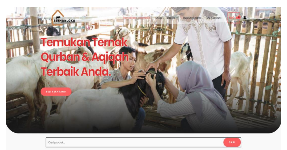
Figure 3. Application View

In addition, this application has also increased transparency and openness in the process of selling livestock. Prospective buyers have better access to information on livestock conditions and farm locations, resulting in a more efficient buying process and increased trust between sellers and buyers.