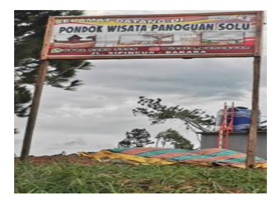
Figure 5. Panoguon solu

Destination location tour This is in the Village Parulahon, District Lintongnihuta. Destinations This located at a height 330-2075 meters on surface sea. Destinations This stand since December 23 2019 built by Tumpak Sihombing and distance about 2km from Geosite Sipinsur. Panoguan Solu means withdrawal boat from top (the peak in question here is place tour this) to bottom (lake toba).