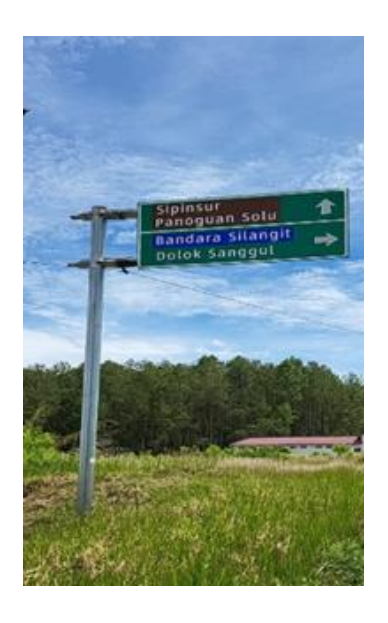
Figure 2. Landscape language pointer direction to location object tour Panoguon solu

Destination location tour This is in the Village Parulahon, District Lintongnihuta. Destinations This located at a height 330-2075 meters on surface sea. Destinations This stand since December 23, 2019, built by Tumpak Sihombing and distance about 2km from Geosite Sipinsur. Panoguan Solu means withdrawal boat from top (the peak in question here is place tour this) to bottom (lake toba ).