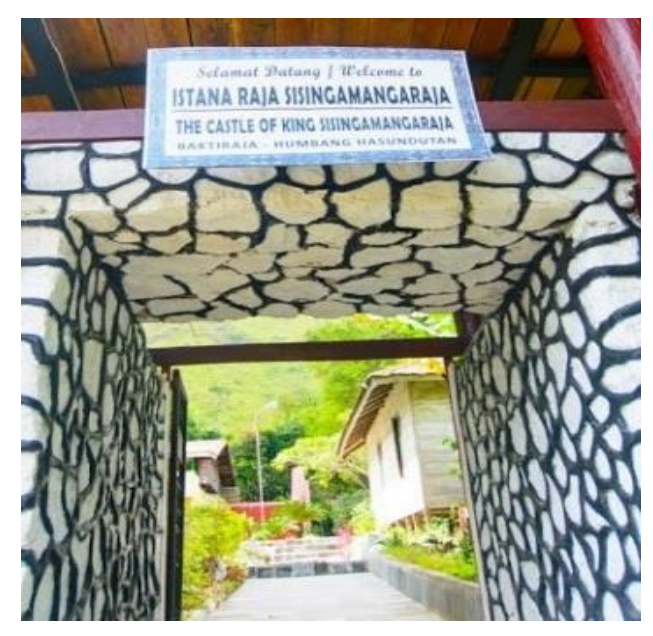
Figure 4. Palace of King Sisingamangaraja

Destination location tour This is in the Village Simamora (Bakkara ), District King 's Service . Tourist location history which is location headquarters struggle of King Sisingamangaraja -XII and from here it is he devising a war strategy the guerrilla. That said at headquarters here it is all goods magic and the weapon he uses for war on save But after his death headquarters it's on fire and stuff the much is lost. A existing monument there is monument The struggle of King Sisigamangaraja -XII is also called Sinom hudon .