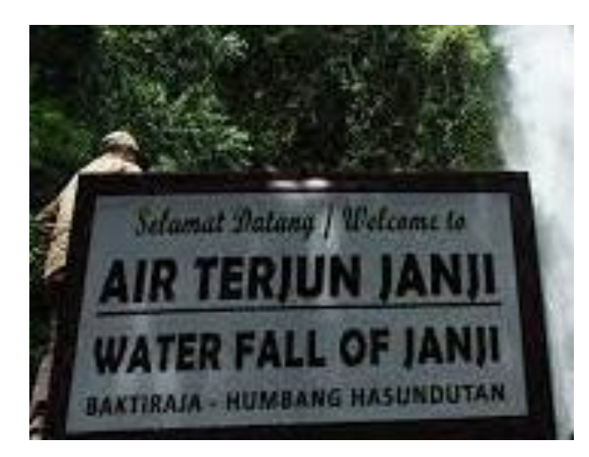
Figure 2. Air Terjun Janji

Tourist sites located in the Village Marbun with object tour in the form of a waterfall with 40-meter height, as well can also be used as bathhouse with water depth approx one meter. The distance to the location of the waterfall from subdistrict Baktiraja is about 1 Km and can take use vehicle wheels 2 and 4 with condition road good asphalt the rest 100 meters achieved with walk follows stone paths and ledges Genre waterfall.