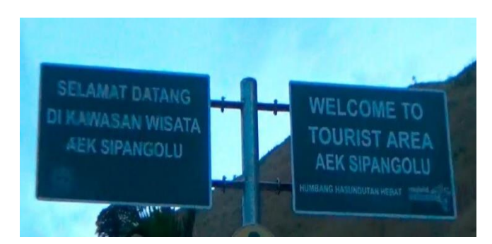
Figure 1. Landscape language pointer direction to location object tour Aek Sipangolu

Tourist sites located in the Village Simangulampe with destination tour natural in the form of a waterfall beautiful little and is place bathhouse. Ack Sipangolu located in a village remote in Bakkara, that is Village Simangulampe. Simangulampe is one villages in the District Bakti Raja, Regency Humbang Hasundutan, North Sumatra province, Indonesia. Village Simangulampe is on the coast beach Lake Toba with beautiful scener, and located on a slope the mountains where the hills are made land agriculture For resident around .