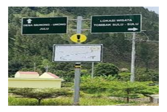
Figure 3. Landscape language pointer direction to location object tour Tombak sulu-sulu

Destination location tour This is in the Village Marbun Dolok (Bakkara), District Bakti Raja, Regency Humbang Hasundutan. The rocks that are here are aged about 250 million years. The keeper is Ronald Lumbangaol. Spear It means forest wilderness and Sulu Sulu It means torch, so Tombak Sulu Sulu is forest radiating wilderness a speck light (torch).