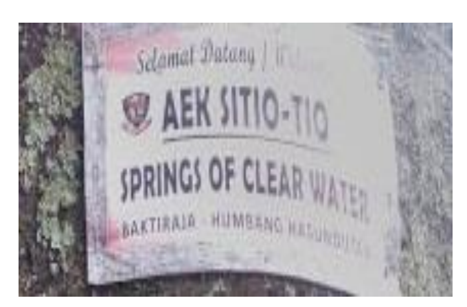
Figure 3 Aek Sitio Tio

Destination location tour This is in the Village Siunong Unong (Bakkara), District King 's Service. This location is where king Sisingamangaraja I stabbed his stick in the rock and took out clear springs to bath and drink.