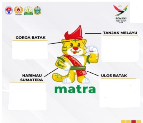
Figure 2. MATRA PON XXI Mascot for North Sumatra Region

The following is a picture of the MATRA mascot used in the North Sumatra region: