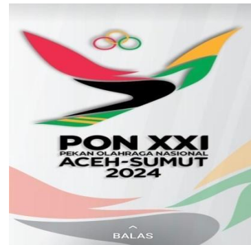
Figure 1. Logo of PON XXI SUMUT-Aceh

Champions". Everything is explained in this picture: