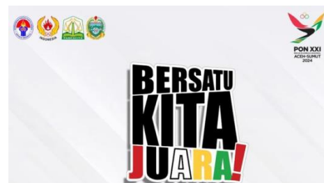
Figure 3. PON XXI 2024 Tagline

The following is a picture of the tagline used at PON XXI in SUMUT-Aceh: