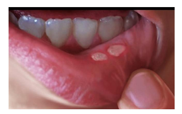
Fig. 1 Mucocutaneous lesions on the inside of the lips' mucosal surface

The authors report an unusual clinical case of a 22-year-old woman who presented with predominantly mucocutaneous lesions and general complaints that exhibited a relapsing and remitting nature. The patient presented to the Primary care physician with symptoms including intermittent fever, weight loss, odynophagia, dysphagia, arthralgias, abdominal pain, and multiple painful superficial round erosions of the oral mucosa and lips, with a diameter of approximately one centimeter (Figs. 1, 2).