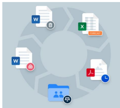
Figure 3. NextCloud File Transformation [30]

NextCloud allows all kinds of files. As shown in figure 3; text, presentation, design documents, videos, and photos can be stored in NextCloud. NextCloud's cloud allows multiple people to collaborate without the risk of version-control issues [33].