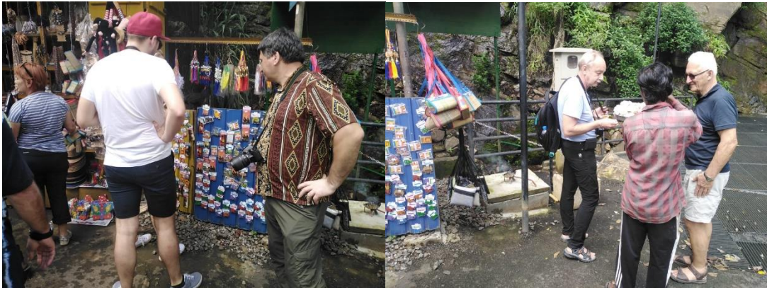
Figure 1. Peddlers Engage in Mobile Selling at Rawana Ella

Tourist arrivals to this region generate a huge demand for local transport services and food. Therefore, the businesses which provide transport facilities and food, tiffin, snacks, fruits and other related services and facilities are a noticeable feature of the informal sector. Accordingly, there are 12 persons who provide food and associated services while 11 persons provide transport services. The demand related to the transport service is due to many reasons. The study area is located at a proximity to the most popular train route of Sri Lanka. Tourists use Colombo-Badulla trains up to Demodara railway station where the world famous Nine Arch Bridge and the railway loop are located and travel to the different tourist sites using the transport facilities provided by the local, small scale transport providers. On the other hand, the public transport system of the area too is not at a satisfactory level. Since most of the tourist sites have been scattered all over the region, it is a difficult task to travel by public transport. This background ultimately increases the demand for privately owned transport services which are mostly operated by local residents.