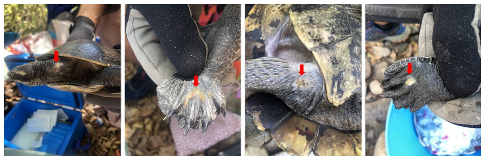
Fig. 1 Skin lesions (red arrows) on the neck and limbs of freshwater turtles (Krefft's river and Saw-shelled turtles) at Alligator Creek

Freshwater turtle sampling was conducted in Alligator Creek 25 km south of the city of Townsville, Queensland, Australia (latitude: -19^{\circ} 25' 26.00'' S; longitude: 146^{\circ} 56' 44.02'' E). The creek flows from Mount Elliott in Cape Bowling Green National Park to Cleveland Bay within the region of Cape Cleveland (Queensland). The lands along Alligator Creek outside the National Park have a population of approximately 1353 people with a range of agricultural and industrial activities (Australian Bureau of Statistics 2016). The sampling pond at the border of the national park is inhabited by two species of freshwater turtle, Emydura macquarii krefftii and Myuchelys latisternum as well as other freshwater animal species including fish, crustaceans and crocodiles. Samples were also collected from the Ross River in Townsville, Queensland, Australia