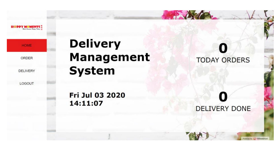
Figure 2. Administrator Dashboard

Goods delivery and route management system has been developed using web-based systems with Bracket software and mobile-based systems Android Studio. The system database is developed through the MySQL Database operated by phpMyAdmin. The user interface for web-based applications includes the Login module, Register module, Product Management module, Order module, Delivery module, and Reporting. For mobile devices, the interface involves the Registration module, the Delivery module and the Order module. Figure 2 shows the administrator dashboard.