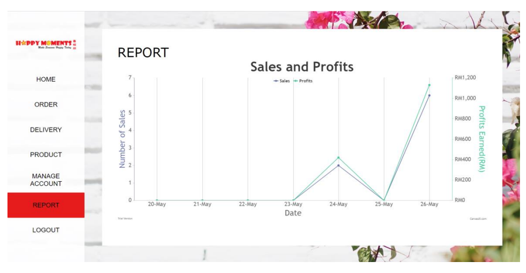
Figure 7. Report Interface

Figure 8 shows the mobile-based system delivery interface. There will be a navigation button for each request, a call button, and a change status button for the driver to facilitate delivery. This program will open a third-party navigation application (Google Maps) that will specify the