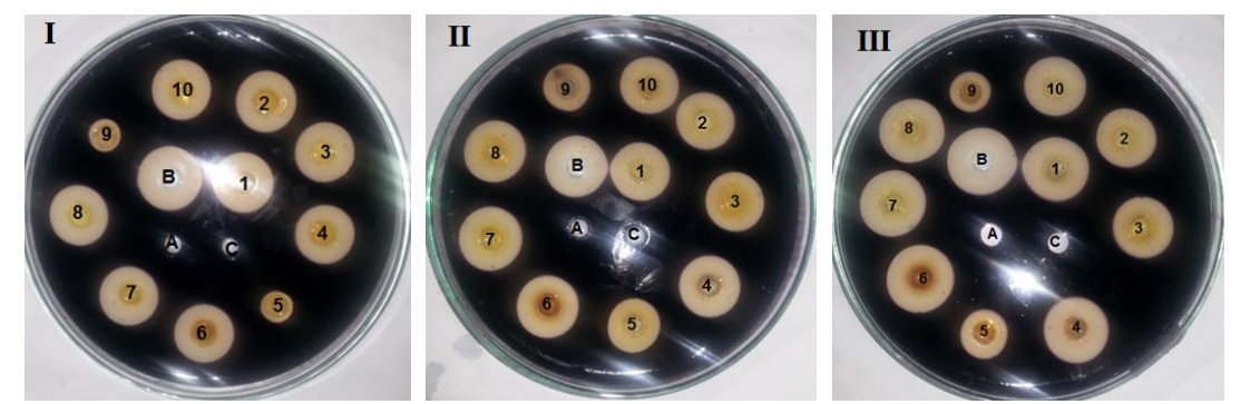
Figure 4. (I, II, III): Screening the inhibition of \beta -lactamase derived from Klebsiella pneumoniae by ten plant extracts. (I) Inhibitory influence of plant acetone extracts on \beta -lactamase from K. pneumonia . (II) Inhibitory influence of plant aqueous extracts on \beta -lactamase from K. pneumoniae . (III) Inhibitory influence of plant ethanol extracts on \beta -lactamase K. pneumoniae .

solution, C = HgCl_2 solution + \beta -lactamase solution + penicillin G solution (positive control), Blank = Not calculated.