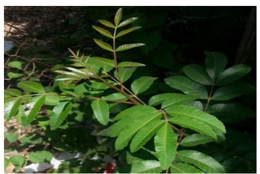
(Schinus terebinthifolius) (Withania somnifera) Figure 1. The ten investigated medicinal plants.