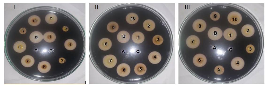
Figure 3. (I, II, III): Screening of \beta -lactamase activity derived from Staphylococcus sciuri by ten plant extracts. (I) Inhibitory effect of plant acetone extracts on \beta -lactamase from S. sciuri . (II) Inhibitory influence of plant aqueous extracts on \beta -lactamase from S. sciuri . (III) Inhibitors influence of plant ethanolic extracts on \beta -lactamase from S. sciuri .