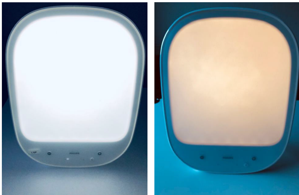
FIGURE 2 Experimental light conditions in the “Life-ON” RCT. Left: bright light (10'000 Lux). Right: red dim light (19 lux)

whole follow-up period (Figure 1C). Simple log-linear regression showed a significant effect of BLT on response to treatment ( \beta = 1.96 , z -value = 2.05, and p = 0.04 ). When controlling for other influencing factors, best model fit was achieved including EPDS at study entry ( \beta = -1.1 , z -value = -1.8 , and p = 0.07 ), BLT ( \beta = 0.6 , z -value = 0.2, and p = 0.8 ), loss of work in the previous 6 months ( \beta = -2.5 , z -value = -0.4 , and p = 0.7 ), unplanned pregnancy ( \beta = -3.97 , z -value = -1.1 , and p = 0.3 ) and positive history of depression ( \beta = 2.7 , z -value = 0.95, and p = 0.3 ) with Tjur's R^2 = 0.75 . No women reported major side effects after either BLT or DRL, as assessed by the Systematic Assessment for Treatment Emergent Events at 3 and 6 weeks of treatment.