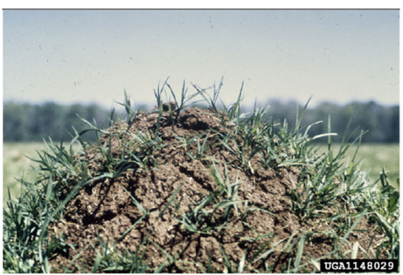
Figure 1: USDA APHIS PPQ - Red Imported Fire Figure 2: USDA APHIS PPQ - Red Imported Fire Ant (adult)