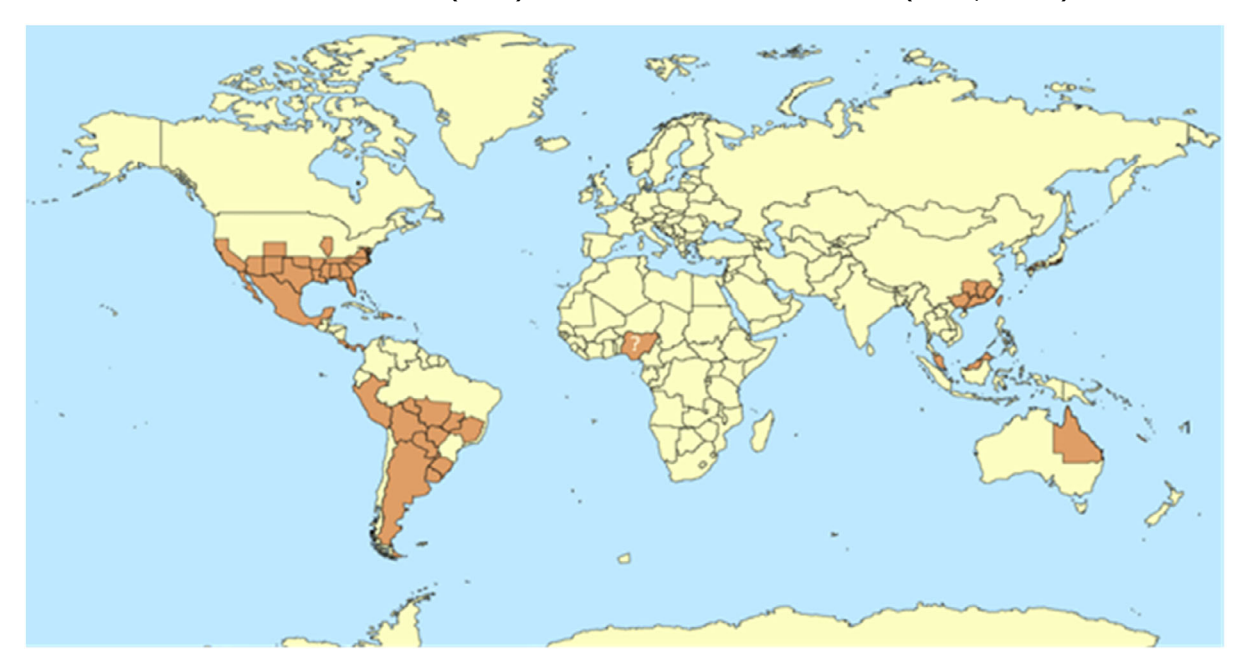
Figure 3: Global distribution of Solenopsis invicta (data source: EPPO Global Database accessed on 21/12/2022). Note that the occurrence of S. invicta in Nigera is considered unproven

The ant was accidentally introduced into the southern United States in the early 20th century. Several papers suggest that the first introduction occurred in Mobile, Alabama, in the 1930s. However, Vinson (1997) suggests the first introduction actually occurred in 1918. Regardless of when the first introduction occurred, S. invicta now occupies much of the southern USA (Needleman et al., 2018). Figure 3 shows the global distribution of S. invicta. Appendix B provides details of the global distribution based on Gunawardana (2014) and the EPPO Global Database (EPPO, online).